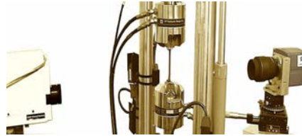
Figure 1- Experimental setup

current, Eulerian configuration) were linearly interpolated spatiotemporally using the positions of the deformed configuration given by the DIC computation.