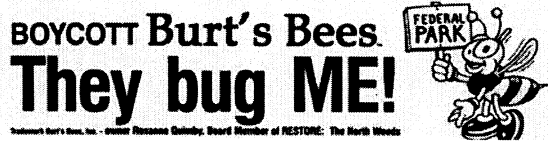
FIGURE 5 Bumper stickers like this reveal the direct and unfavourable connections that many area residents made between Burt's Bees and the MWNP.