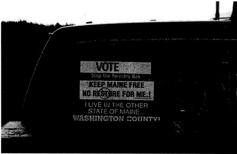
FIGURE 3 Public statements such as these (supporting the forest-products industry, opposing RESTORE and expressing cultural distinctions between different regions of Maine) are not uncommon the further north and east you travel in the state.

charm and opportunities for outdoor recreation have attracted visitors from the urban north-east and beyond. 23 More than two million are attracted annually to Acadia National Park on Maine's rocky coastline, and tens of thousands visit Baxter State Park in its forested interior each year. By some measures, then, a new national park would merely build on Maine's tradition of tourism.