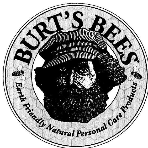
FIGURE 1 Rather than using glamorous models or glittering imagery, Burt's Bees has traditionally chosen a more natural, rustic and earthy look for their packaging, thereby reinforcing the company's associations with 'earth-friendly' practices.

logging and wood-products manufacturing have been disappearing from here for decades, and many residents struggle daily to make ends meet. Yet surely this is not true for everyone in northern Maine. And surely it is not true for many of the tourists who visit the Maine Woods to hike, fish, hunt, snowmobile and cross-country ski. Indeed, specialty stores and gift shops in area towns often carry higher-priced items aimed at the tourist market, so why not Burt's Bees? What is more, Burt's Bees got its homespun start in a backwoods cabin not far from the same towns whose merchants fail to carry its products today. Although the company has since moved its headquarters out of Maine, some might think its local ties would earn it a place on local shelves. But apparently, it does not.