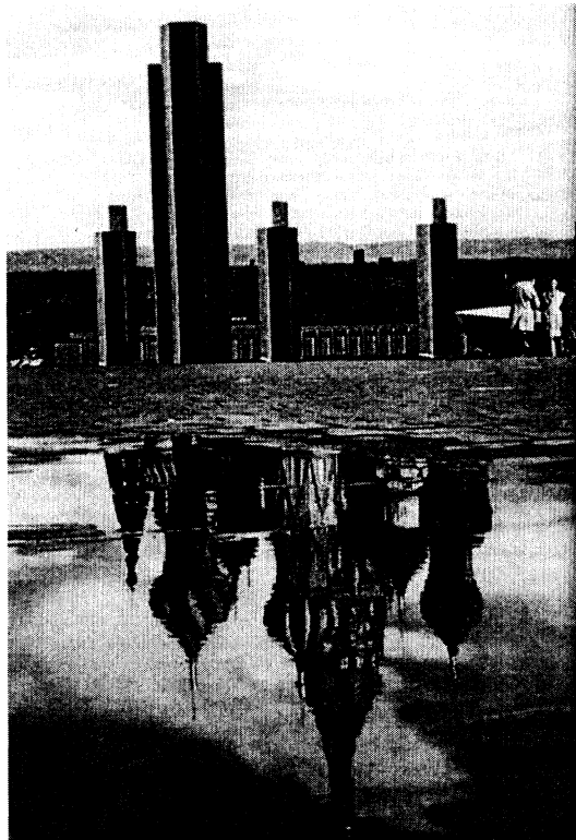
FIGURE 2 A photomontage used in Leonie Sandercock's Towards Cosmopolis (1998), which illustrates how the highrise is scripted into the binarized structure of revisionist planning discourses. (Photomontage reproduced with permission of the artist, Peter Lyssiotis.)

the highrise modernist form. With a rather more global reach, architectural commentators like Charles Jencks have referred to the planned demolition of Pruitt-Igoe (1972) and to the unplanned collapse of Ronan Point (1968) as symbolic markers of the death of modernism and the beginnings of postmodernism, which, in architectural terms, was the 'post' which brought back history, tradition, locality and wiggly bits 39 (Figure 3).