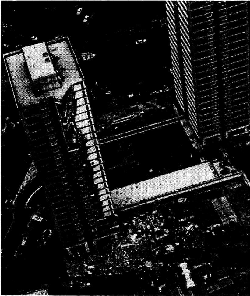
FIGURE 4 The collapsed south-east corner of Ronan Point, following the gas explosion.

with tenants moving in almost immediately. At approximately 5.45 a.m. on Thursday 16 May 1968, just two months after the blocks started to be occupied, there was an explosion in one of the flats on the south-east corner of the block. The explosion blew out the non-load-bearing face walls but also an external load-bearing flank wall, causing a progressive collapse of the floor and wall panels of that corner of the block right down to the level of the podium. Four people died and 17 were admitted to hospital with injuries, with one of the injured dying later. 73 What do we start to see when we get closer to this event: when we move past the emblematic image of collapse depicted in the newspapers of the time, and go inside the building and enter Flat 90, the