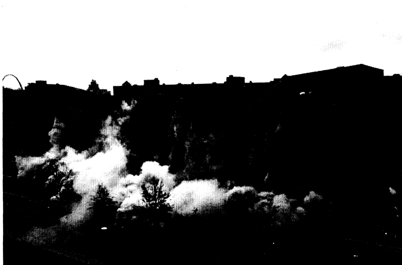
FIGURE 3 The now emblematic image of the planned destruction of Pruitt-Igoe, an event Charles Jencks dubbed as marking the 'end of modernism'.

stuff of saga ... fatal destiny, irreversible good or bad fortune'. 41 Thrift identifies four persistent myths about cities: that all cities are instants in a global space of flows; that cities are becoming homogenized; that cities (or parts of cities) are inauthentic; that one city tells all. Thrift is taking us to where he has been going for some years now intellectually: towards a conception of the city that is formed out of a 'set of diverse and interacting practical orders' which are 'formed, maintained and changed' by what he terms 'networks of associations between unlike actors'. These networks of association are never completed: they are always in a state of being made or unmade by what he calls, again following Latour, 'constant semiotic-cum-material work'. 42