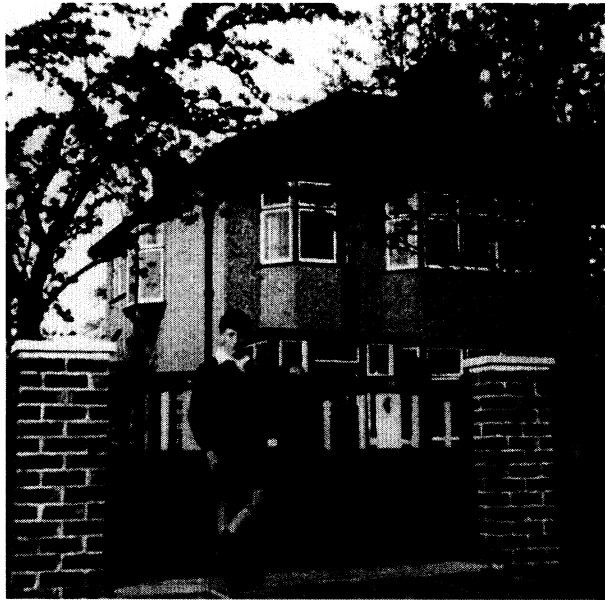
FIGURE 3 John Lennon aged 14, outside his Woolton home, 'Mendips'.

former village of Woolton (Figure 3), a bookish and well-spoken child, singing in the church choir, who turned into that familiar figure, the teenage malcontent; McCartney grew up in a lower-class but more musical household, in a council house, across the municipal golf course, in Allerton; both inhabited a suburban world where they could find common ground, not least at the groups' own pastoral myth of origin, the 1957 Woolton church summer fete where McCartney was invited to join Lennon's skiffle group. This was a view echoed in the biography's harmonious image of the songwriters' current lives in 1967, McCartney the man about town in St John's Wood, Lennon happily married in Weybridge, coming together in the Abbey Road studios.