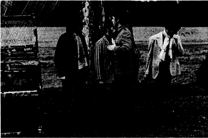
FIGURE 5 The Beatles 30 January 1967 at Knole Park, filming

reversed tape at the end, shows McCartney running backwards and leaping up onto a branch; as the record fades, the group daub the piano with paint.