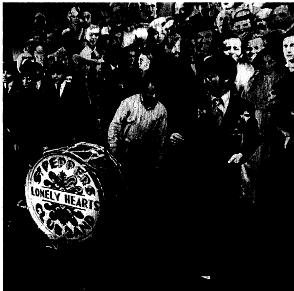
FIGURE 6 Peter Blake and John Lennon at the staging of the cover art for Sergeant Pepper's Lonely Hearts Club Band, 30 March 1967.