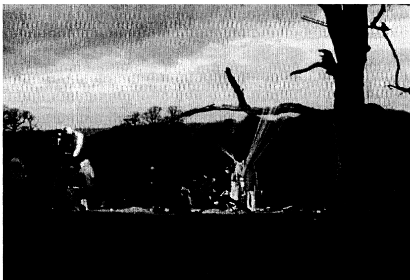
FIGURE 4 The Beatles filming at Knole Park, 30 January 1967

Managed by the National Trust, although owned by the Sackville-West family, Knole Park has a long and complex cultural history, especially over claims to its landscape. 84 Pressure for public access increased with a series of carnivalesque acts of trespass in the later 19th century. 85 In Virginia Woolf's experimental novella Orlando (1928), the park becomes one of Bloomsbury's bohemian landscapes, a shifting space-time tableau to affirm Woolf's literary friend Vita Sackville-West's claim to the estate, the story pivoting on the enduring symbol of an old oak tree on a rise in the park. The scenes for Strawberry Fields forever (Figures 4 and 5) are similarly transgressive and conservative. They are shot in wintry dusk and darkness on a hill known as Echo Mount, because it was a vantage point for listening to was known in Tudor times as the 'musicke' of the deer hunt—the baying hounds and thundering horses, the huntsmen's halloos and horns. Kettle drums are scattered on the slopes; a piano is strung with wires to an oak tree. The main sequence, alluding both to the tree symbol of the song and to its