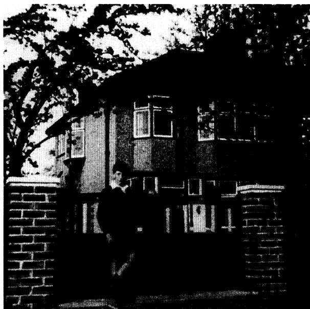
FIGURE 3 John Lennon aged 14, outside his Woolton home, 'Mendips'.

former village of Woolton (Figure 3), a bookish and well-spoken child, singing in the church choir, who turned into that familiar figure, the teenage malcontent; McCartney grew up in a lower-class but more musical household, in a council house, across the municipal golf course, in Allerton; both inhabited a suburban world where they could find common ground, not least at the groups' own pastoral myth of origin, the 1957 Woolton church summer fete where McCartney was invited to join Lennon's skiffle group. This was a view echoed in the biography's harmonious image of the songwriters' current lives in 1967, McCartney the man about town in St John's Wood, Lennon happily married in Weybridge, coming together in the Abbey Road studios.