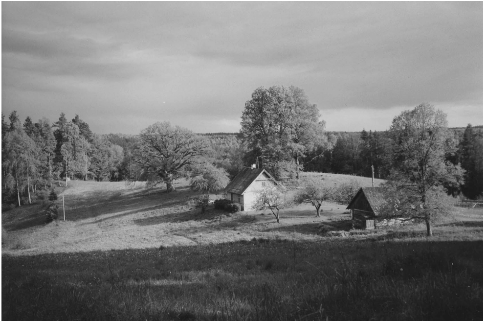
FIGURE 1 Latvian homestead

The agrarian nationalist discourse continued to be reproduced even under Soviet rule through official promotion of folklore and ethnic heritage, subsidization of a very large agricultural sector, semi-official tolerance of private plot farming and dissident practices such as a crypto-nationalist landscape protection movement. To this day, the dominant Latvian notion of national identity remains that of the 'nation of farmers'. As a Latvian sociologist puts it, 'it would be difficult to find another self-reference within Latvian culture that is as capacious and enduring' as that of the 'peasant culture' or 'nation of farmers'. 28 Likewise, the dominant construction of homeland remains the agrarian Heimat : a cultivated landscape of labour or ethnoscape (to borrow Anthony D. Smith's evocative term) that mutually constitutes and is constituted by the Latvian national character and serves as a reservoir of national history and ethnographic uniqueness. 29 Like the landscape of hedgerows and thatch-roofed villages for the English, for most Latvians this cultivated ethnoscape is indisputably the iconic Latvian landscape: a landscape of solitary farmsteads graced with majestic, carefully tended oaks and maples; of 'old country parks and arboretums, protected millponds, ... old field systems ... , winding roads and various other features created by human hands, which vividly demonstrate the history of the relationship between humans and nature' (see Figure 1). 30