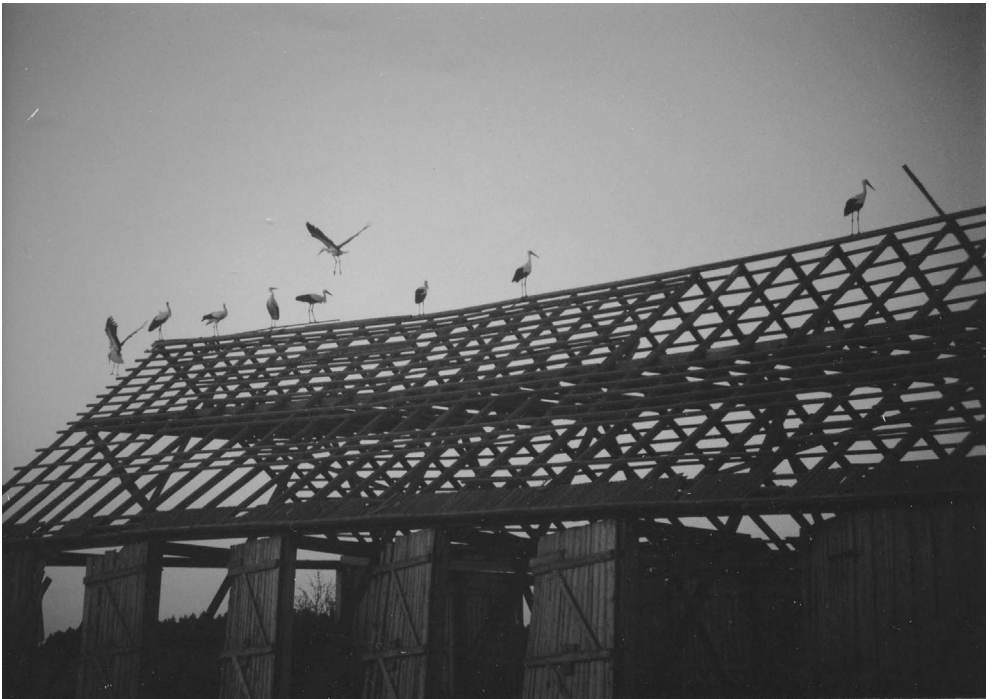
FIGURE 2 Abandoned farm building with storks