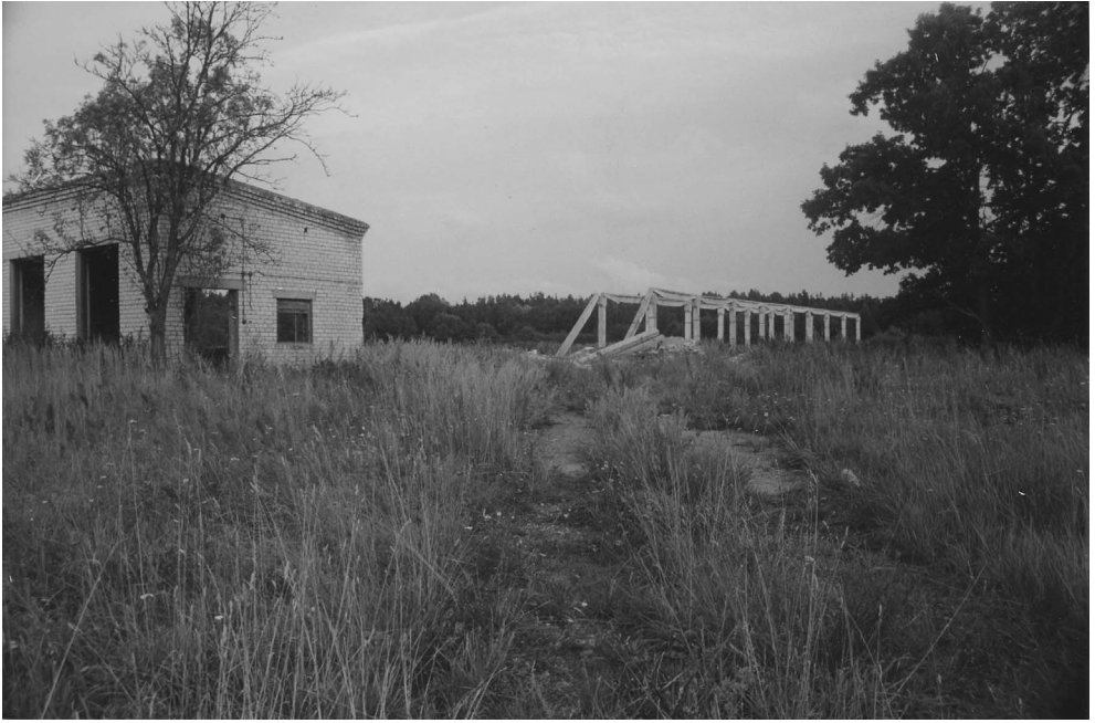
FIGURE 5 The landscape of abandonment

Some measures were implemented during the first phase of the project. The contributory rivers were de-channelized to restore the natural flow of water into and out of Lake Pape. Modern reed-cutting machinery was purchased, enabling local residents to earn income from the export of reeds (popular as a roofing material in Denmark and Germany) while also helping to increase the lake's open water. Activities were undertaken to promote ecotourism as a central aspect of the area's future economic development, including construction of a bird-watching tower on the lake and some modest visitor facilities. Project staff persuaded two local families to open bed-and-breakfast operations. Toward the goal of building local capacity for economic diversification, a credit union was established and adult education courses were offered – and widely attended – in tourism, foreign languages, business and basic computer skills.