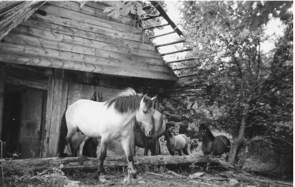
FIGURE 6 Konik horses at Lake Pape

The introduction of Konik horses was intended as the first step toward creating what the Dutch team called a ‘new wilderness’: ‘a large unbroken area where natural processes can take place with the least possible disturbances’. 44 Human activities – mowing, reed cultivation, manipulation of water levels – were to be kept to a minimum. Eventually the sluice gates controlling Lake Pape’s tidal flows would be