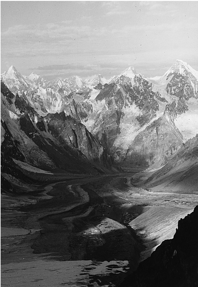
FIGURE 2 Typical Ibex habitat north of Hushe village. Ibex graze on the vegetation found in glaciated valley bottoms and on mountain spurs.

to stalk ibex on Hushe lands (Figure 2). Ibex are a valued trophy within the international hunting community, and the hope was that opening a limited market for the hunt would bring substantial funds into the community. Eventually the government approved a limited hunt, with the agreement that 75 per cent of the proceeds from the sale of the permits would go to the village while the remainder would go to the government. 12 The marketing of permits takes place largely through the annual convention of Safari Club International, an organization of relatively wealthy hunters. 13 Approval was also given by CITES to transport the carcass of a trophy animal to the hunter's country of origin. 14 In Hushe, it was decided that during the first year, money from the sale of permits would be distributed equitably among the 100 village