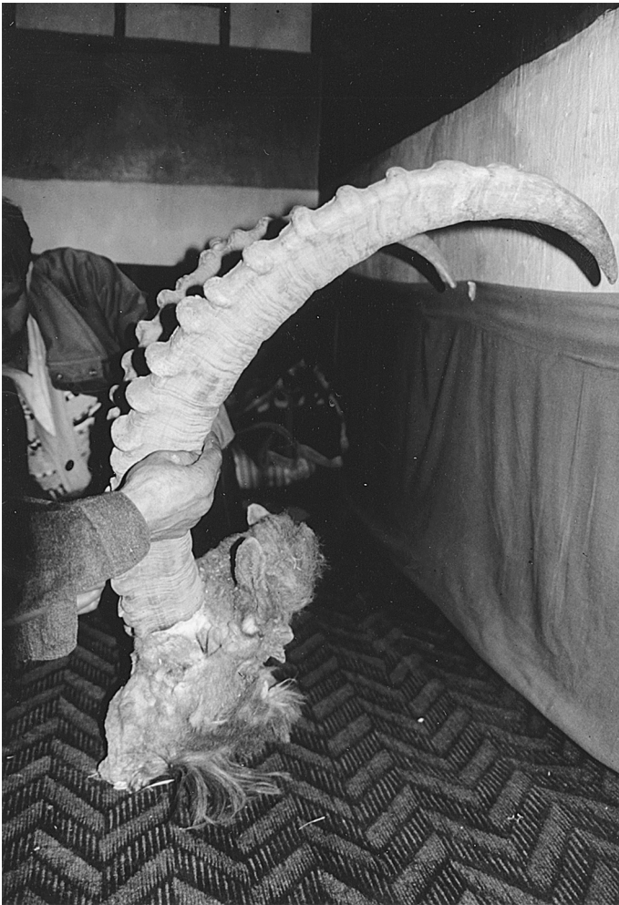
FIGURE 3 The head of an adult male ibex, approximately 10 years old. The meat from this animal was distributed within the village and the skin was made into a backpack for carrying grain.

people significant to the hunter as a means of wishing them good health and commenting on the continued significance of their authority. Ibex meat is also distributed amongst filial and fictive kin as a means of expressing a social commitment to their wellbeing and fostering strategic allegiances. Just as ibex have symbolic value for villagers, they also hold symbolic value for international trophy hunters. Far from being interested in conservation, trophy hunting is motivated by wildlife as an object of desire. This desire is not a purely individualized phenomenon, however, but is fed by a particular reward structure within a 'community' of hunters. International trophy hunting has status value which is reflected in the sanctioning structures of organizations like Safari Club International or the Grand Slam Club, which offer awards to hunters