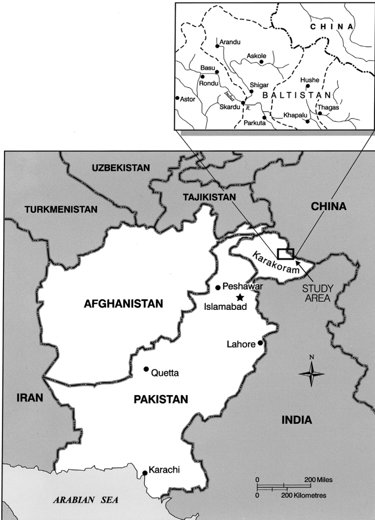
FIGURE 1 Pakistan and study area

(Figure 1). Most inhabitants live in small villages lining the tributary valleys to the Indus and Hunza Rivers, engage in subsistence agro-pastoralism, and continue to focus on internal modes of production, distribution and consumption. 10 For centuries, the Hushpong have supplemented their cereal-based diet by hunting ibex ( Capra ibex ), a large mountain goat. In 1996 the World Conservation Union 11 (IUCN) approached village leaders in Hushe with a plan. If the village leaders would agree to prevent villagers from hunting ibex, IUCN would pursue an agreement with the government of Pakistan and the Convention on International Trade in Endangered Species of Wild Fauna and Flora (CITES) that would permit the sale of permits for international hunters