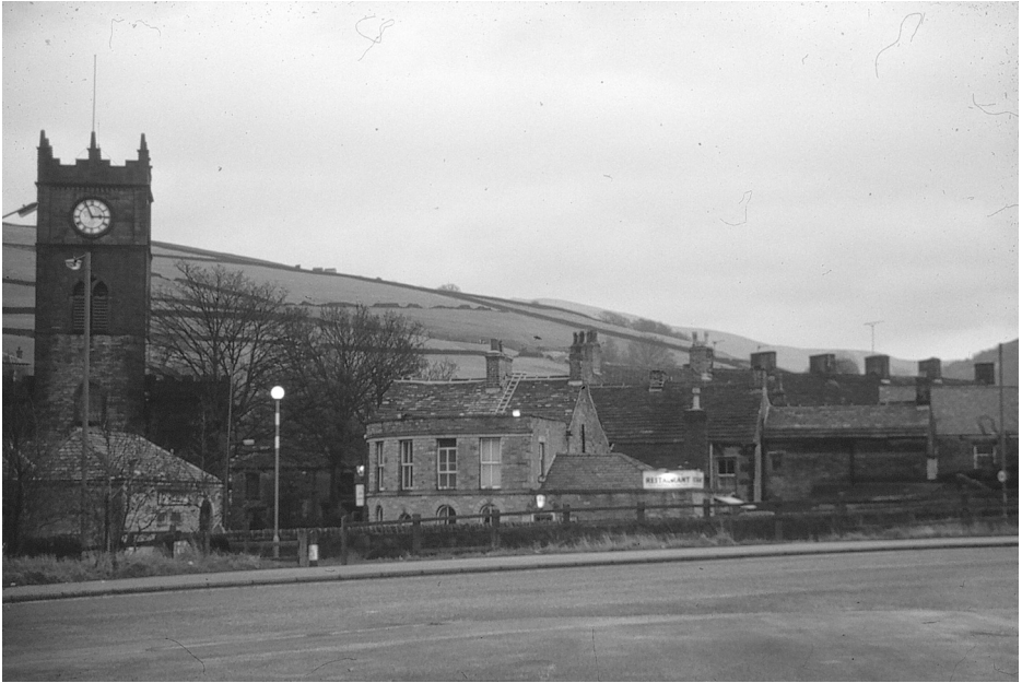
FIGURE 4 Scene of the 1932 'Kinder trespass', in which labourers demonstrated for the right of access to the English open countryside.

effectively makes one an alien, or foreigner, in the land. Alienation, however, is also a philosophical concept, with implications for the analysis of the historical role of landscape representation. Alienation is a vital theme in the tradition of the early nineteenth-century idealist philosophy of Georg Wilhelm Friedrich Hegel, in which the material being of humankind is seen to be foreign (or alien) to the ideal natural realm of pure ideas; and a century later it was revived again as a central philosophical concept. 57 I will largely take my point of departure in the influential work of the literary scholar and philosopher Georg Lukács, who helped spark the renewed twentieth-century interest in alienation, and whose ideas are of clear relevance to the analysis of landscape presented here.