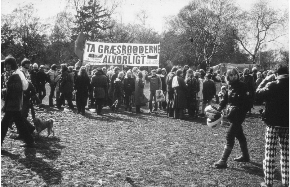
FIGURE 3 Scene from May 1 demonstration on the Copenhagen commons. The sign reads ‘Take the grass roots seriously’, reflecting the symbolic importance of the level swathe of leaves of grass that constitutes the commons. Unfortunately, this symbolic act of demonstrating on the green is a bit hard on its symbolic referent, the actual grass of the commons, which is being trampled into the mud.

and soggy moorlands. This movement, though controversial, mobilized a political clout which was to achieve the establishment of national parks in Britain. 55 The movement, however, was broader than this, and it also included less radical organizations, such as Lord Eversley’s Commons, Forests and Footpaths Society (now known as the Open Spaces Society), which were able to effectively use English common law to argue for the preservation of common land as parks, particularly in urban areas. 56 A contemporary visitor to many of England’s city parks is likely to forget that these places were once working commons; but the idea that cities and nations ought to have shared landscapes, to which the larger citizenry has rights of access, springs from a long heritage of ideas rooted in shared rights to common land. A park of this kind is a far cry from the private landscape parks created by estate owners on what was often enclosed common land.