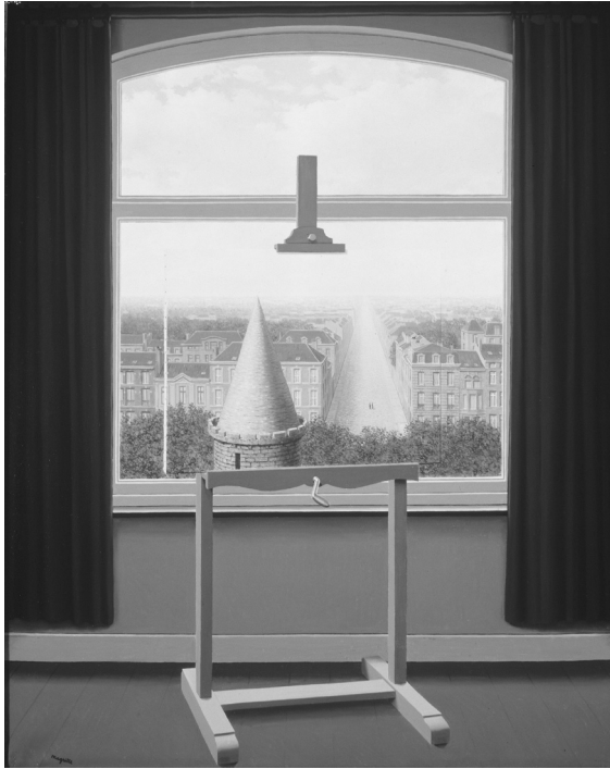
FIGURE 2 Where Euclid walked by René Magritte, 1965

that both the landscape on the easel and the landscape seen from the window represented in the painting are (like the pipe) not landscapes, but representations of landscape. The painting is not just a representation of a landscape however; it is the symbolic representation of the idea of landscape as an expression of an ideal geometric archetype. The painting has a subtext, which reads ‘Where Euclid walked’, and if we look closely we see that the tower of a building has the same Euclidean shape as the boulevard that stretches from the window out to the horizon. The painting is thus not just a representation of landscape, but a representation of the way a perspective representation of landscape is generated through the use of Euclidian geometry as framed by a square window.