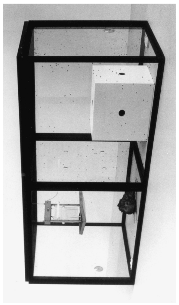
FIGURE 3 A thousand years