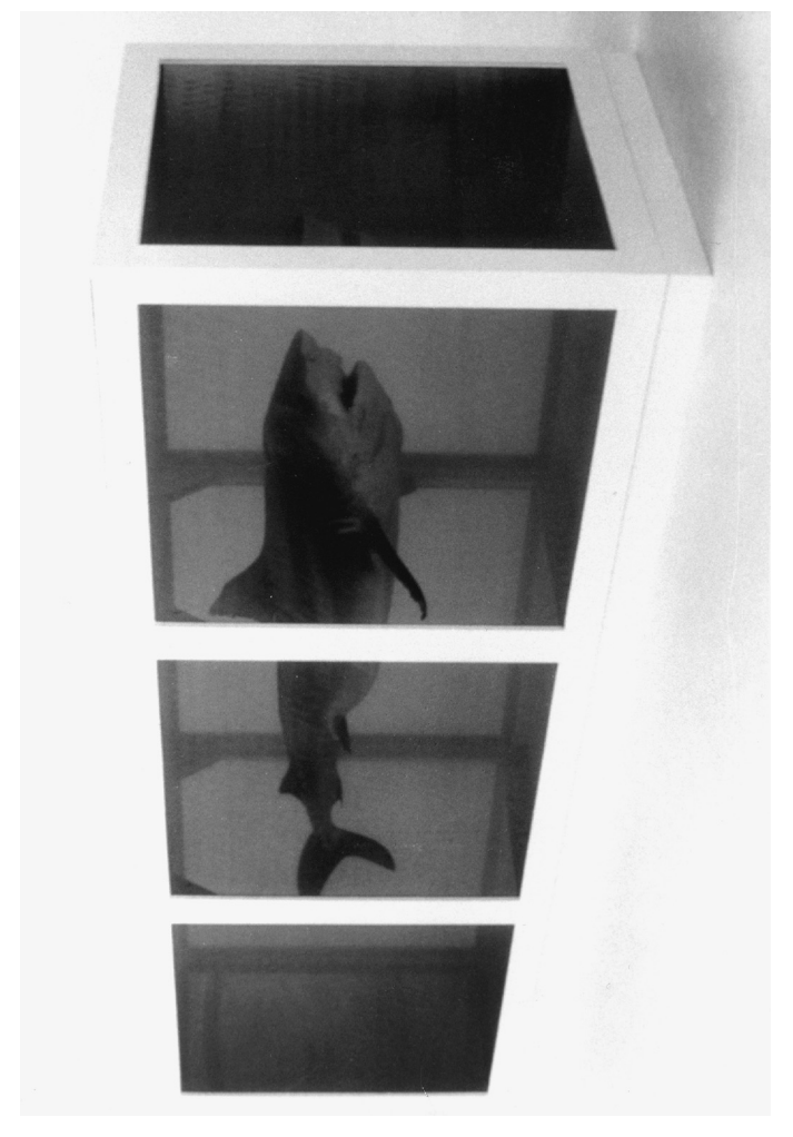
FIGURE 2 The physical impossibility of death in the mind of someone living