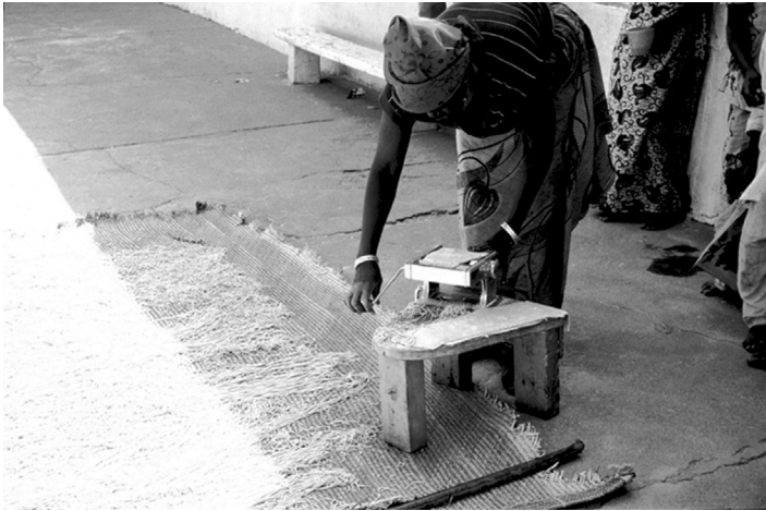
FIGURE 3 Photograph 17, ' Talia '. A palace concubine makes talia or spaghetti using a modern device. Talia has been known in Kano for probably hundreds of years. The word derives from Italy or 'Italia'. Wheat is a delicacy consumed mostly by aristocracy. In the 1500s Kano was one of the three most important cities of Africa and a renowned entrepôt intersected by several major trans-Saharan trade routes. Trans-Saharan traders stayed in North and West African towns for months or years at a time, establishing families and kinship networks. Likewise, North and West African Islamic merchants and scholars travelled southward, establishing themselves in villages and towns, including Kano. Talia 's presence in Kano shows how vital precolonial Kano–Mediterranean connections were, connections the British severed after their conquest of 1903.

The third photograph used to evince a concubine presence and concubine histories and labours was Photograph 17, ' Talia ' (Figure 3). Here we see a concubine named Asmau bent over at the waist, her head pointed towards us, her face thus obscured. Her right hand reaches out and turns the crank on a shiny new manual spaghetti maker, out of which stream noodles. In front of her left leg is a small stool upon which sits a sheet of rolled-out spaghetti dough, ready to be made into spaghetti after she finishes with the first sheet. Off to her right on the ground is a straw mat upon which are reams of spaghetti strands drying in the sun, waiting to be collected up and sold. The catalogue caption tells the viewer that talia is the Hausa word for spaghetti, a noodle probably introduced into Kano centuries ago as a result of trans-Saharan Mediterranean trade where goods from Italy (hence, talia ) could be obtained. A primary source from