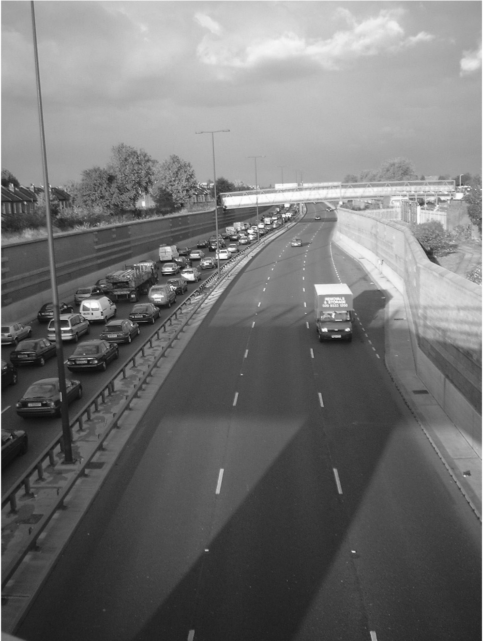
FIGURE 2. 'I know that if my house was still there, it would be hanging in space above the inside northbound lane.' View of the M11 link road from the Linked route.