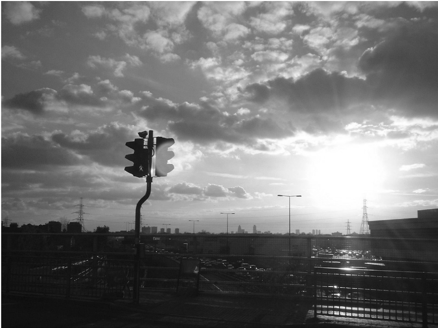
FIGURE 1. 'Where's London?' View of the city from Leyton Underground station.

I pace up and down the bridge. It is cold; I dig my hands into my coat pockets. I listen, I look. I stare in at the people slowly driving their cars. They don't know what is going on, what I am experiencing. They haven't got a clue. They don't realise that they are walk-on parts in the play today. They are driving over the ruins of a community. A part of London that was flattened. Not by bombs – the 350 homes were predominantly