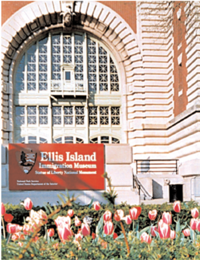
An exterior section of the restored building at Ellis Island.

Migration is in many ways a phantasmagorical phenomenon, hence Hardt and Negri's comments about the world being haunted by its spectre. 13 Despite the biopolitical projects of national governments, its essence, meaning and significance often remains difficult to adequately grasp, even in an era of advanced globalization. It is within the biopoetics of memory that stories about 'ghosts' haunting Ellis Island abound. Through this case study of Ellis Island we may explore how migration's meaning seeps through the representational and governmental categories it often remains enclosed within. 14 Contemporary folklore celebrates Ellis Island's main hall as the site of unexplained phenomena throughout the years yet relatively little attention has been given to what this omnipresent sense of a haunted migrant heritage landscape might signify.