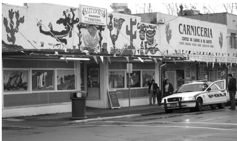
FIGURE 1 Downtown Woodburn