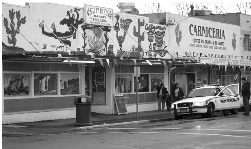
FIGURE 1 Downtown Woodburn, photo taken by author in 2004.