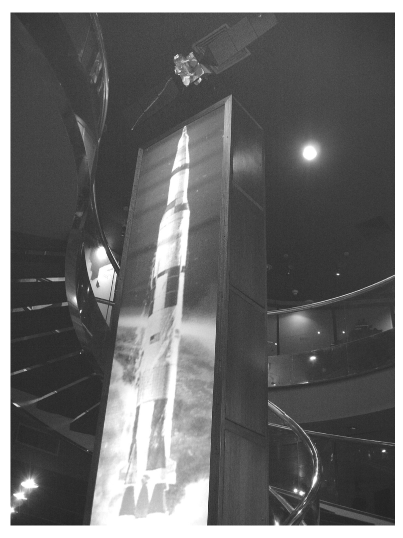
FIGURE 4 The takeoff of modernization symbolized by an Apollo rocket launch.

imagined identity always implies the absence of such an identity at the point beyond its boundary'.<sup>57</sup> The Apollo rocket is a celebrated symbol of American (thus, 'foreign') technological prowess. With its prominently displayed American flag it might confront visitors who are differently Malaysian with an outside Other against which they may perhaps (re)define their identity as 'Malaysians' – that is, as a group identity based on shared characteristics imagined in opposition to all that is not-Malaysian. Recall, for example, how the moon launch figured prominently in the conversation described earlier between a father and son as they discussed a return home for the Mooncake Festival over the telephone. Questions of identity were raised there with respect to concerns about losing 'traditions' in the face of being (or becoming)