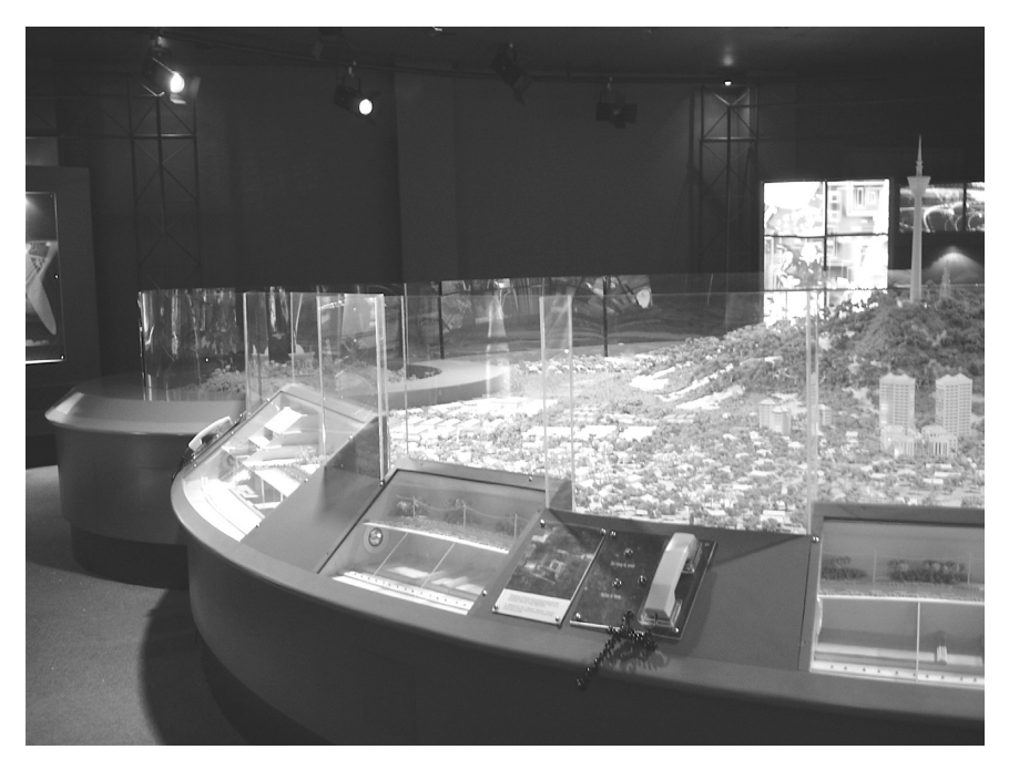
FIGURE 5 Diorama of 'The City'.

in Ferguson's sense of the term.<sup>64</sup> Described in the Design Concept , the diorama represents 'a range of demographies and geographies, from the suburban fringes of a big city, to the industrial estates, the factories and the countryside and coastline' – absent, however, are any signs of squatters.<sup>65</sup> This diorama is not a model of Kuala Lumpur – or of any actual city – it is a model of 'The City'. Like Winichakul's maps, it is a proper noun intended to turn human beings into verbs, the performers of proleptic myths of nationhood that prescribe ways of appropriately being in, and belonging to, 'Information Age' Malaysia.