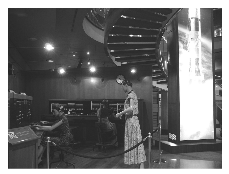
FIGURE 3 Display depicting a '1960' telephone exchange.

An efficiently working exchange demanded co-operation, teamship and dedication to the task. Women of all races and backgrounds found employment in the industry an opportunity to become active members of Malaysians (sic) modern history.<sup>52</sup>