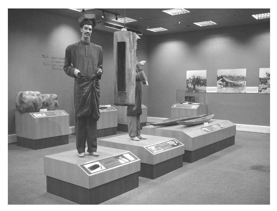
FIGURE 2 Display showing a ketok-ketok.

The national narrative being told in these and adjacent displays pushes imaginings of Malay indigeneity to what is today contemporary Malaysia over a wide territory and far back in time,