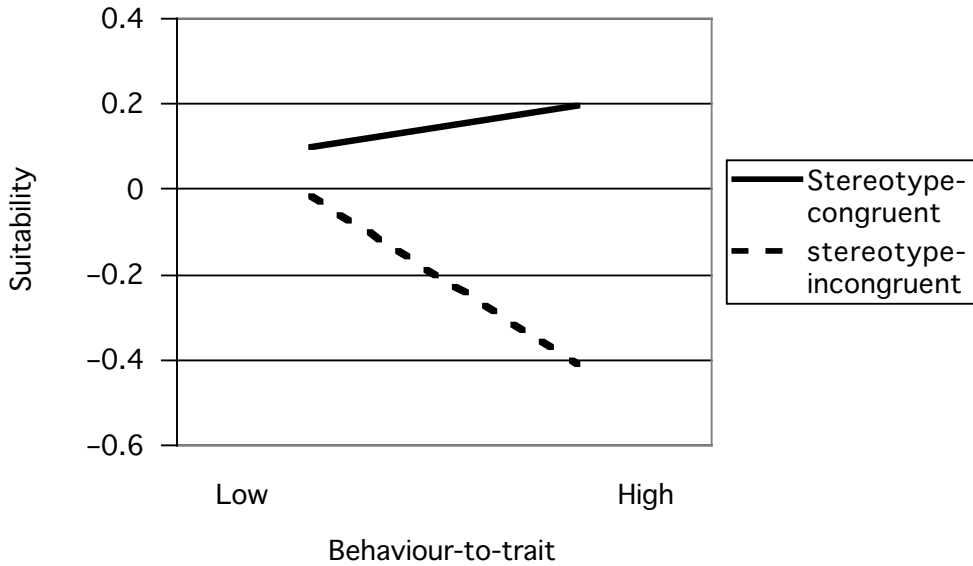
Figure 3. Suitability as a function of trait inferences from stereotype congruent vs. incongruent behaviors.

research by showing, within a unifying experimental paradigm, that this inference process is asymmetrical.