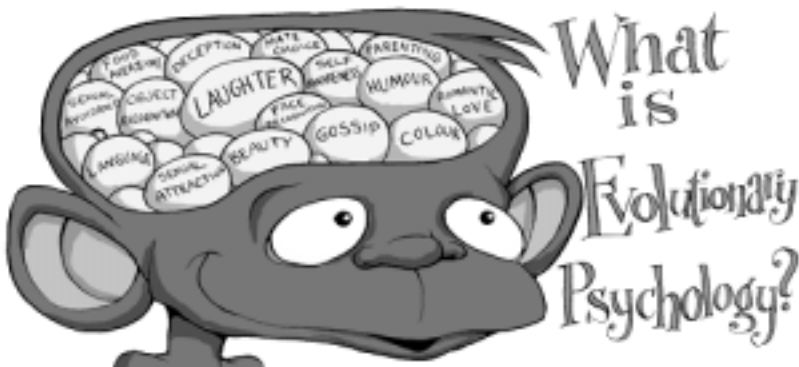
Figure 3. Image by Alex Hughes, taken from “What is Evolutionary Psychology?” on the website Evolution’s Voyage . 19

two are seen as synonymous, reflecting the materialist stance of cognitive psychology. The circles labeled “laughter,” “language,” “sexual attraction” and so on indicate a specific model of the mind held by evolutionary psychologists: massive modularity. The massive modularity thesis sees the mind as made up of many independent units, each of which handles a specific task, such as language. This model was developed out of earlier ideas about modularity developed in cognitive psychology (Fodor, 1983), but massive modularity is still controversial within that discipline (e.g. Fodor, 2000). The representation of these modules is interesting, with the gray color and three-dimensional shapes recalling the exposed physical brain, but the labeled circles on the brain’s surface also recall the nineteenth century study of phrenology, which evolutionary psychologists often claim as a precursor to their own science (see, e.g., Evans and Zarante, 1999: 37). 20 The image also looks to be one of a monkey, thereby symbolizing human origins and links with other animals, as well as evolutionary psychology’s connections with biology through evolution-