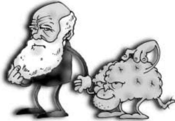
Figure 2. Image by Enrico Biondi, taken from the essay, “Evolutionary Psychology” on the website A Field Guide to the Philosophy of Mind . 18

two are seen as synonymous, reflecting the materialist stance of cognitive psychology. The circles labeled “laughter,” “language,” “sexual attraction” and so on indicate a specific model of the mind held by evolutionary psychologists: massive modularity. The massive modularity thesis sees the mind as made up of many independent units, each of which handles a specific task, such as language. This model was developed out of earlier ideas about modularity developed in cognitive psychology (Fodor, 1983), but massive modularity is still controversial within that discipline (e.g. Fodor, 2000). The representation of these modules is interesting, with the gray color and three-dimensional shapes recalling the exposed physical brain, but the labeled circles on the brain’s surface also recall the nineteenth century study of phrenology, which evolutionary psychologists often claim as a precursor to their own science (see, e.g., Evans and Zarante, 1999: 37). 20 The image also looks to be one of a monkey, thereby symbolizing human origins and links with other animals, as well as evolutionary psychology’s connections with biology through evolution-