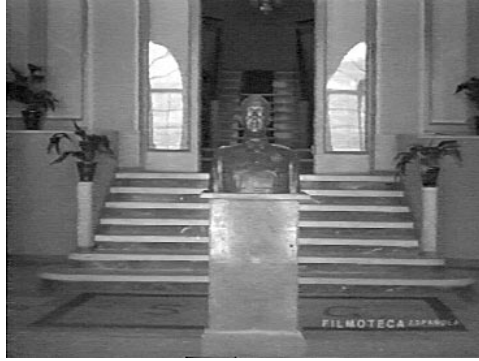
Figure 2. NO-DO 321-B, 1949.