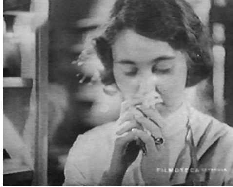
Figure 4. NO-DO 35-A, 1943.