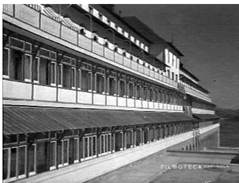
Figure 1. NO-DO 321-B, 1949.

The dictator was present at half of the 52 inaugurations covered by NO-DO between 1943 and 1970. 21 The selection of locations for his appearance does not appear to have been random. In the aftermath of the Civil War, Franco seemed particularly active in the Basque Country, which had an especially damaged relationship with the “Spanish” national identity,