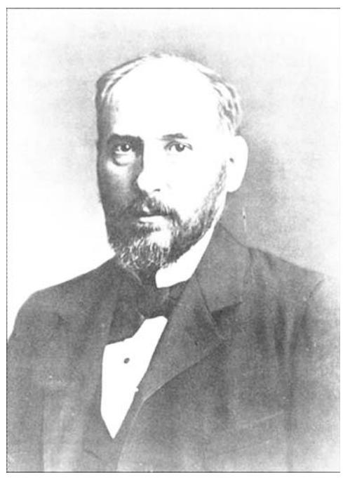
FIG. 1. Santiago Ramón y Cajal in 1899, aged 47

doctrinal authority of Emil Kraepelin (1856–1926), maintained the somatic character that had been consolidated over the last third of the nineteenth century. It was undoubtedly these scientific influences that assigned mental disorders to alterations in the anatomical substrate, and this led to the hypothesis that the mental processes governing everyday life (thought, consciousness, intelligence, imagination, memory, etc.) must also be located in a particular anatomical substrate. This approach to understanding the psyche and its disorders inevitably linked up with the morphological and neurobiological proposals put forward by Caial.