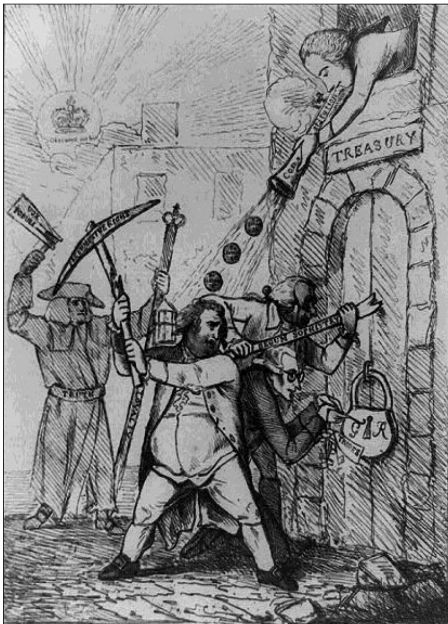
FIG. 2. 'House-Breaking, before Sun-Set'

(Anonymous engraving, published 6 Jan. 1789 by R. Buttens. Source: USA Library of Congress, Prints and Photographs Division, LC-USZ62-94207)