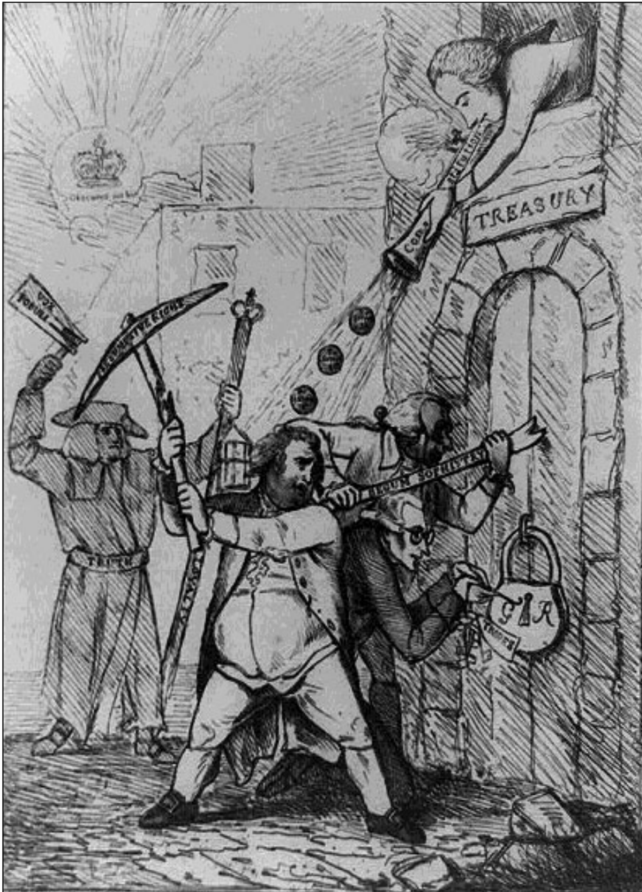
FIG. 2. 'House-Breaking, before Sun-Set' (Anonymous engraving, published 6 Jan. 1789 by R. Buttens.)