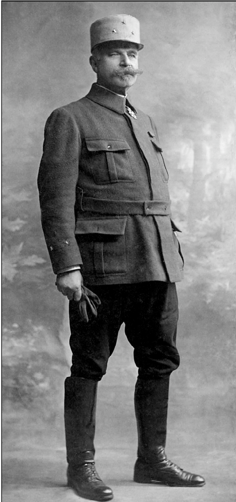
FIG. 2. General Mengin, c. 1914

enfeebled and diminished. Time passes in an identical state of lifelessness. 25