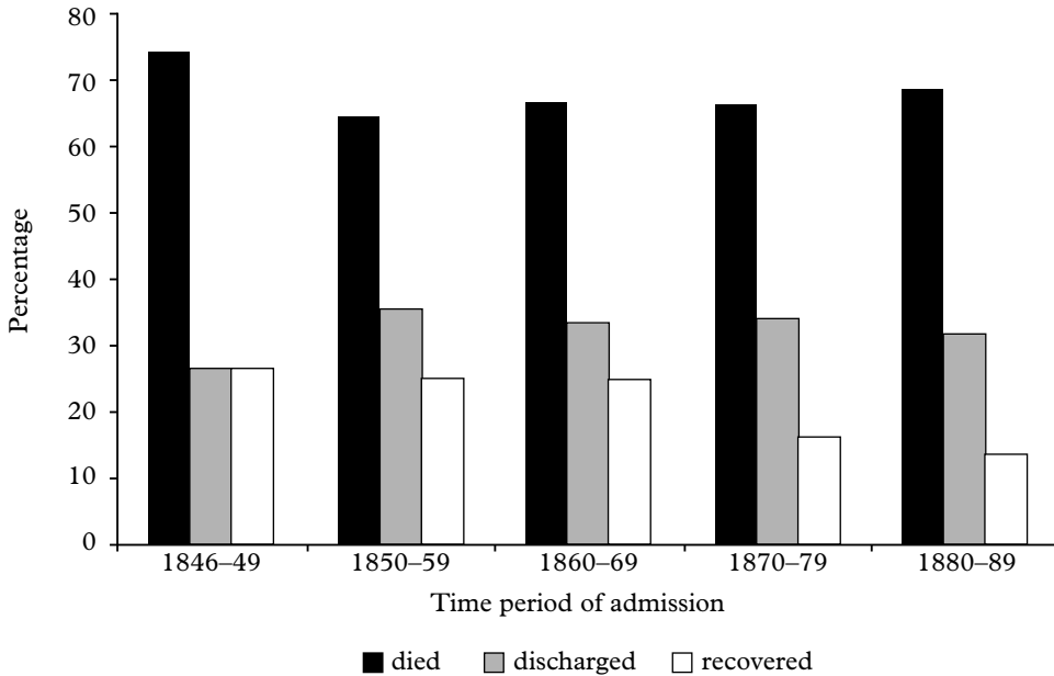
FIG 2. Outcome of Littlemore admissions over 10-year admission time periods

Agreement over assignment of modern diagnoses There was 92% concordance in the assignment of modern diagnoses to the case vignettes by 5 consultant old-age psychiatrists. The inter-rater agreement between GY and CH was 100%.