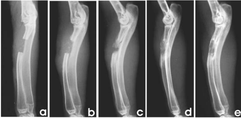
Figure 1. Lateral radiographs of the radius treated with cancellous bone autograft: (a) immediately after surgery and at; (b) 15; (c) 30; (d) 60; and (e) 120 days postoperative. The beginning of bone neoformation may be seen at the proximal radius cut edge and at the center of the defect on postsurgery day 15 (b), which occupies about 70% of the defect 30 days postsurgery (c). At 60 days postoperative, newly formed bone occupies 100% of the defect (d) and at 120 days postsurgery, bone remodeling is detected (e).

homogeneous in all limbs. There was no modification of the bone alignment. Immediately after surgery, the defects treated with cancellous bone autograft were also radiolucent. At 15 days after surgery, the beginning of bone formation could be observed, primarily developing from the radius cut bone ends and the ulnar side. Progressive bone formation was observed at the other time periods. The percentage of new bone formation within the bone defect was approximately of 77.8, 85, and 100 at 30, 60, and 120 days after surgery, respectively. Radiopacity similar to the contiguous bone was observed in 25% of the limbs at 120 days after surgery and there were signs of bone modeling. The presence of a radiolucent area in the center of the defect was seen in only one limb (Figure 1).