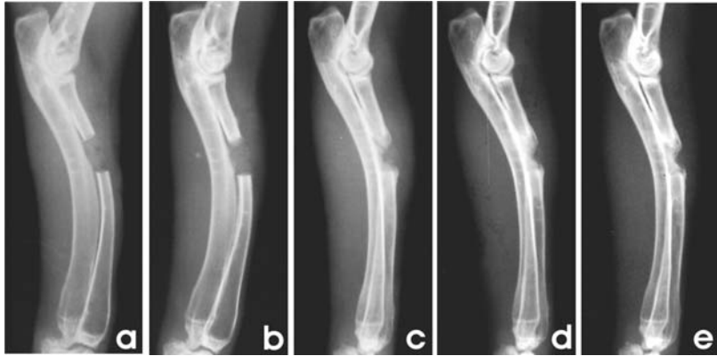
Figure 2. Lateral radiographs of the radius treated with polyurethane containing castor oil: (a) immediately after surgery and at; (b) 15; (c) 30; (d) 60; and (e) 120 days postoperative. New bone formation was observed from the cut edges of the radius and from the cranial face of the ulna that occupies about 60% of the bone defect on postoperative day 30 (c). At 60 days postsurgery (d), newly formed bone was observed occupying 79% of the defect. On postsurgery day 120 (e), there is no increase in percentage of bone neoformation, but there are signs of bone remodeling.

The histological evaluations of the defects treated with cancellous bone showed intense cartilaginous formation at 15 days postoperative. Trabecular bone neoformation areas originated from the cut bone ends of the radius and, specially, from the ulna surface. Connective tissue derived from the periosteum was present in the middle and cranial areas of the defect. The bone graft was not observed. At 30 days postsurgery, the cartilaginous tissue was decreased and its replacement by trabecular bone was observed. Bone neoformation was increased, filling almost all the defect area. Connective tissue was covering the cranial surface of the defect. At 60 days, the trabecular bone area was decreased compared to 30 days postoperative due to the bone modeling process and areas of bone marrow development. These areas were detected all over the segmental defect, but without a defined medullar canal. The bone cortex was still incomplete. At the final time point (120 days), cartilaginous tissue had been completely replaced by bone tissue, except in one animal. The bone marrow area was increased, forming a well-defined medullary canal. All animals showed bone cortical linking both edges of the radius (Figure 3(a)).