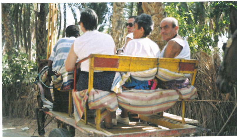
Tourists in the Nefta palm grove

grove, they do not see gardens, or cultivated small plots, but a forest—a forest of palm trees. This can be partly explained by a European-centered historic mechanism: Europeans have their own history of the landscape and of “natural nature.” According to Jean-Claude Chamboredon,