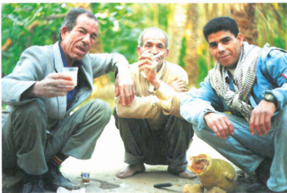
Males meeting to drink palm wine in the gardens under the palm dates

but is also needed for the tourism sector. Tourism service officers and hotel architects align their view with international standards and maintain that a swimming pool is required to satisfy European tourist expectations. In the Jerid, the mayor of Tozeur (the capital of the region) and owner of Dar Chraïet hotel (bearing his name) went even further: he offered a 50-hectare golf course in the desert. Along with thalassotherapy and cultural tourism, golf is part of the new measures adopted by the Tunisian government to diversify the tourist product.