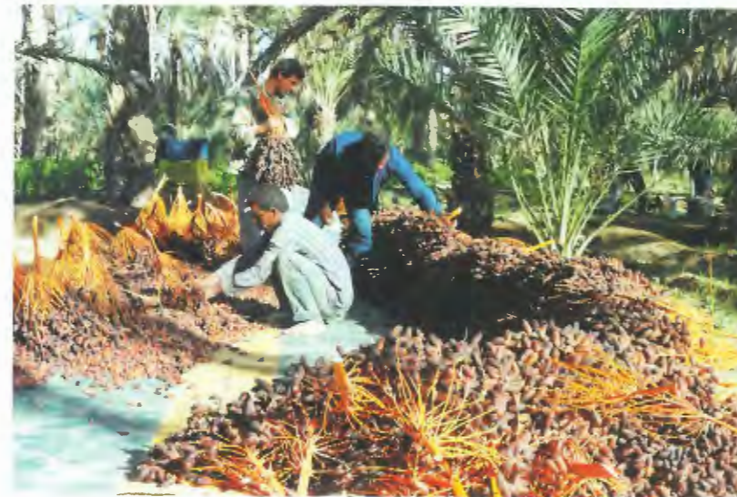
The date harvest

In the same way, young people learned to not consider their local customs archaic (although many still want to emigrate to Europe, in part to escape from them), but as valuable components of the local cultural package—not to live it, but to display it. The tradition is a point of convergence between tourism and the local society: the ‘ adât wa taqâlid ’ (“local customs”) are in both cases perceived as a heritage—fixed, timeless, and vouching for the true local oasian identity. In this respect, the local interface with tourism goes further in forestalling touristic desires: they even claim in the Jerid a local Berber heritage (a very recent claim) when such connection is unthinkable by the local community as a whole; to the contrary, local identity is built on Arab (and Muslim) affiliations. Tourists’ demands (especially French and German tourists) to see Berbers is strong enough to be relayed and reified locally (French colonial discourse highlighted the Berber component of North Africa to legitimize its annexation to Europe, given the presumed Latinity of Berber culture). Concerning the palm-grove spaces, young people operate a “purification” by excluding the compromising practices—living the oasis from the inside, like their forefathers—and by bringing out only its aesthetics.