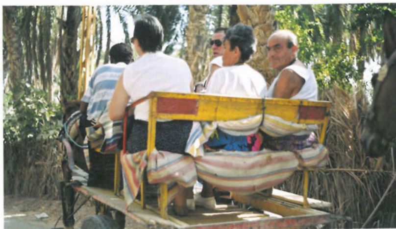
Tourists in the Nefta palm grove

grove, they do not see gardens, or cultivated small plots, but a forest—a forest of palm trees. This can be partly explained by a European-centered historic mechanism: Europeans have their own history of the landscape and of “natural nature.” According to Jean-Claude Chamboredon,