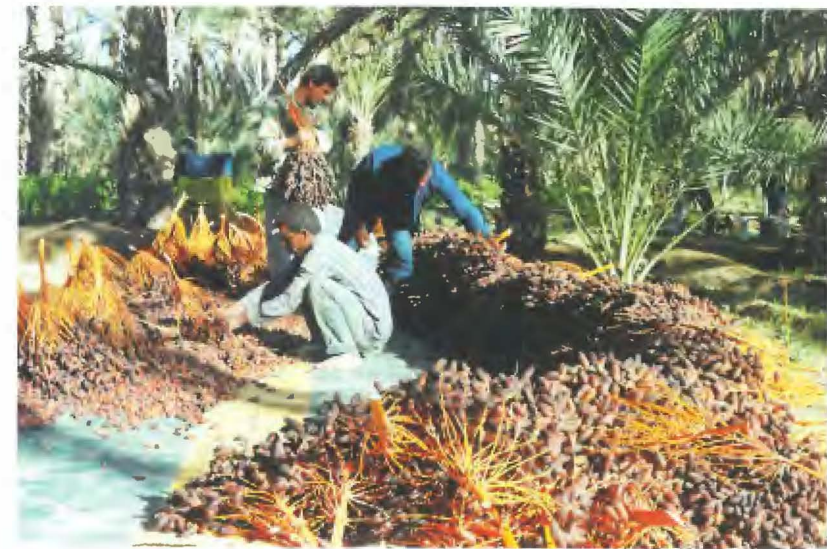
The date harvest

In the same way, young people learned to not consider their local customs archaic (although many still want to emigrate to Europe, in part to escape from them), but as valuable components of the local cultural package—not to live it, but to display it. The tradition is a point of convergence between tourism and the local society: the ‘ adât wa taqâlid ’ (“local customs”) are in both cases perceived as a heritage—fixed, timeless, and vouching for the true local oasian identity. In this respect, the local interface with tourism goes further in forestalling touristic desires: they even claim in the Jerid a local Berber heritage (a very recent claim) when such connection is unthinkable by the local community as a whole; to the contrary, local identity is built on Arab (and Muslim) affiliations. Tourists’ demands (especially French and German tourists) to see Berbers is strong enough to be relayed and reified locally (French colonial discourse highlighted the Berber component of North Africa to legitimize its annexation to Europe, given the presumed Latinity of Berber culture). Concerning the palm-grove spaces, young people operate a “purification” by excluding the compromising practices—living the oasis from the inside, like their forefathers—and by bringing out only its aesthetics.