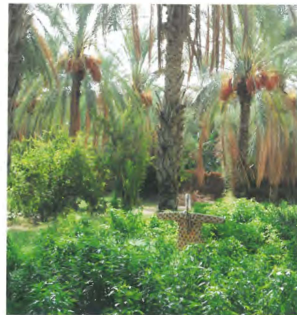
An oasis garden

The oasian garden is private property, but also a place for collective presence: working together in long and difficult labor, and in idle moments, sipping tea during the day or drinking alcoholic beverages from the palm sap at night—talking, sharing experiences, stories, songs, news. In the oases of Jerid, one can always find men