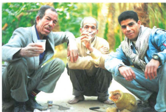
Males meeting to drink palm wine in the gardens under the palm dates

Tourism shapes oasian lands indirectly through services and infrastructure, but also through the concept of landscape. Tourism offers new ways to "read" nature. We saw that "The 'landscape' is the product of the view of someone who is foreign to it." 9 The local importance of ideas brought in the tourists' baggage cannot be gauged by the