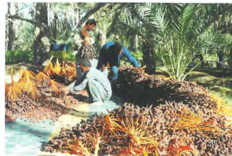
The date harvest

In the same way, young people learned to not consider their local customs archaic (although many still want to emigrate to Europe, in part to escape from them), but as valuable components of the local cultural package—not to live it, but to display it. The tradition is a point of convergence between tourism and the local society: the ‘ adât wa taqâlid ’ (“local customs”) are in both cases perceived as a heritage—fixed, timeless, and vouching for the true local oasian identity. In this respect, the local interface with tourism goes further in forestalling touristic desires: they even claim in the Jerid a local Berber heritage (a very recent claim) when such connection is unthinkable by the local community as a whole; to the contrary, local identity is built on Arab (and Muslim) affiliations. Tourists’ demands (especially French and German tourists) to see Berbers is strong enough to be relayed and reified locally (French colonial discourse highlighted the Berber component of North Africa to legitimize its annexation to Europe, given the presumed Latinity of Berber culture). Concerning the palm-grove spaces, young people operate a “purification” by excluding the compromising practices—living the oasis from the inside, like their forefathers—and by bringing out only its aesthetics.