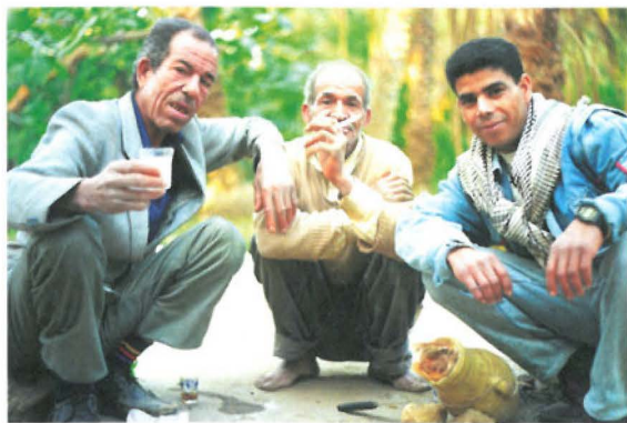
Males meeting to drink palm wine in the gardens under the palm dates

but is also needed for the tourism sector. Tourism service officers and hotel architects align their view with international standards and maintain that a swimming pool is required to satisfy European tourist expectations. In the Jerid, the mayor of Tozeur (the capital of the region) and owner of Dar Chraïet hotel (bearing his name) went even further: he offered a 50-hectare golf course in the desert. Along with thalassotherapy and cultural tourism, golf is part of the new measures adopted by the Tunisian government to diversify the tourist product.