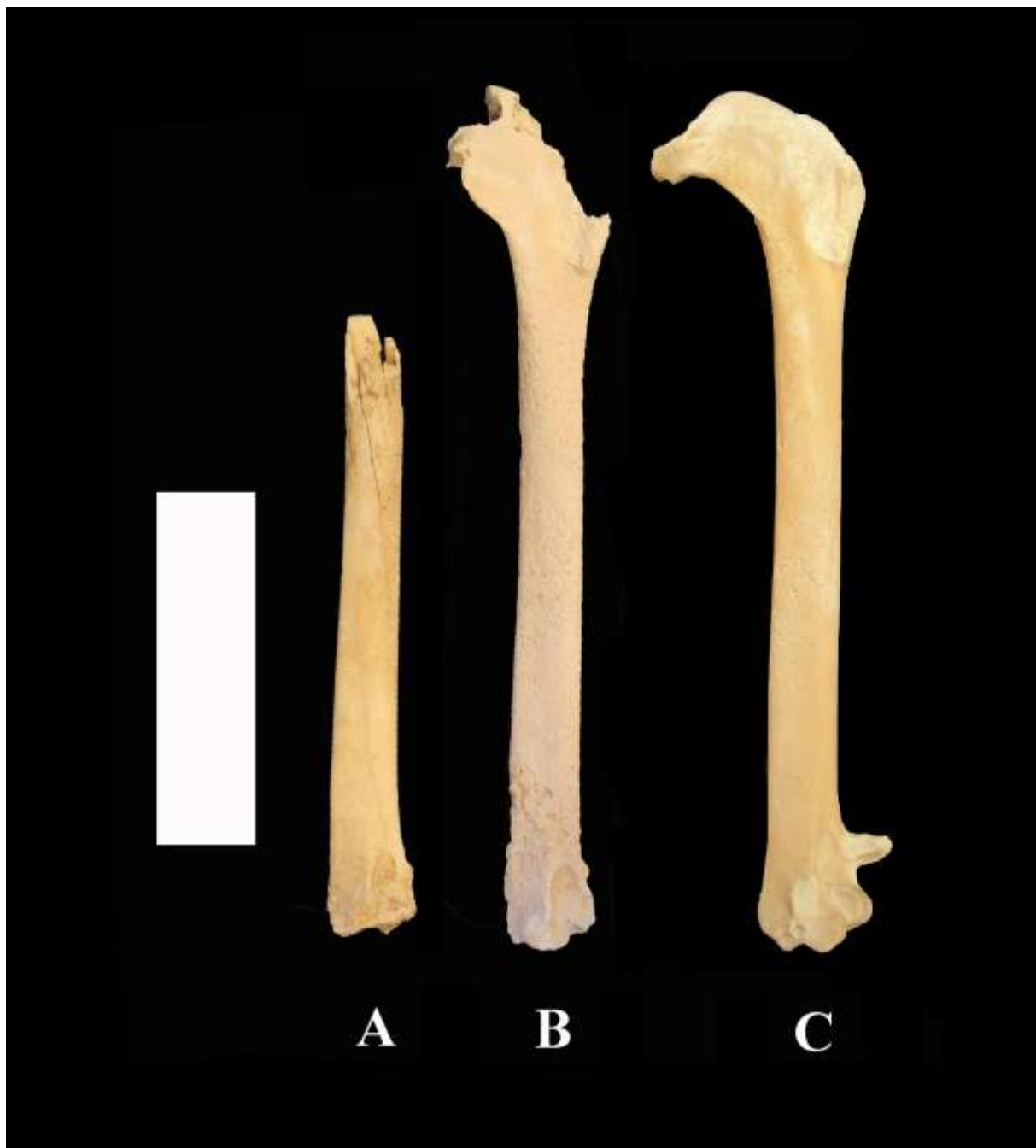
Table 1. Radiocarbon dates of dune shearwater ( Puffinus holeae ). Radiocarbon age (yr BP) and three 2\sigma calibration intervals (cal yr BC) are given. The 2\sigma calibration intervals have been calculated using intcal04.14C, marine04.14C calibration curve and \Delta R = 275 \pm 67 , respectively. C/N, carbon nitrogen ratio; Rc, carbon recuperation rate. 1, this paper; 2, Walker et al. 1990. Calibration for dates older than 26 kyr BP is not possible.