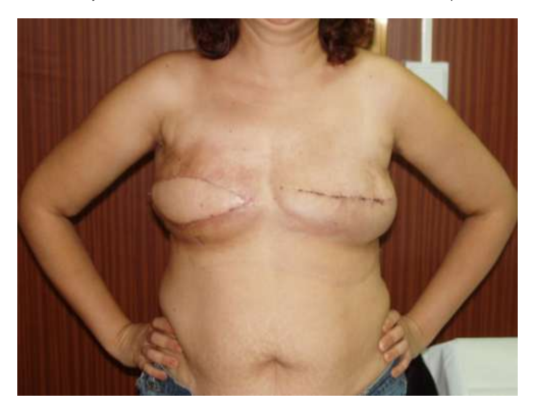
Figure 1. Right breast: Status after radical modified mastectomy, adjuvant radiotherapy and differed latissimus dorsi flap reconstruction. Left breast: Prophylactic total mastectomy and immediate breast reconstruction with a tissue expander.