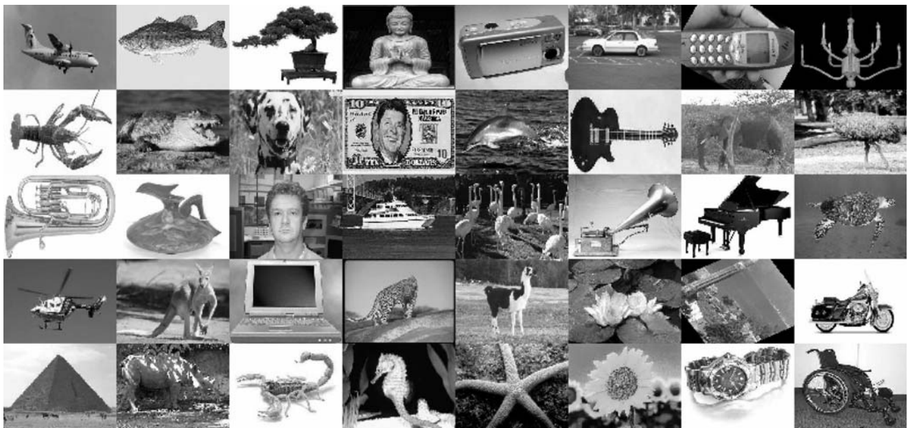
Figure 4 The selected classes from the Caltech101 database.

and there are limited samples per class, which in turn degrades the classification performance.