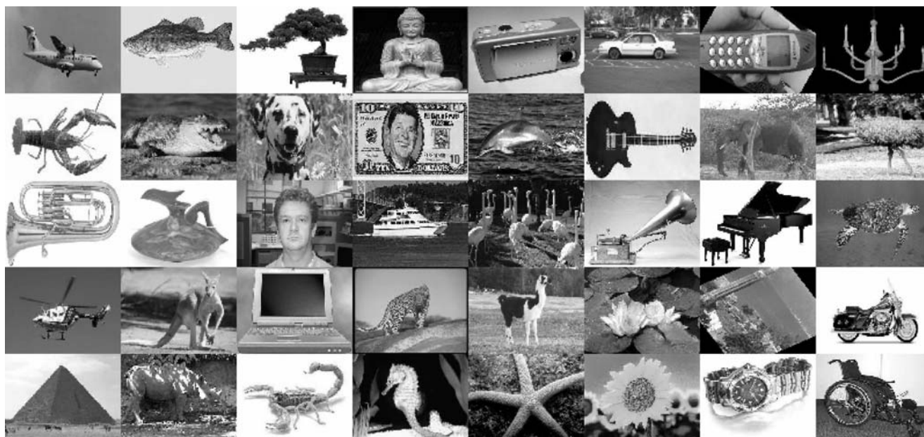
Figure 4 The selected classes from the Caltech101 database.

and there are limited samples per class, which in turn degrades the classification performance.