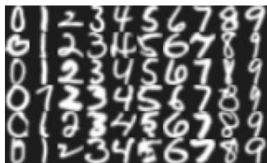
Figure 3 Some samples from the USPS database.

Tangent distance has been shown to work well for the classification of hand-written digits [1, 25]. It improves the classification rate by compensating for small spatial affine transformations and changes in the thickness of the pen stroke. We use both the two-sided tangent distance and the Euclidean distance in our experiments as in [6]. We compute the tangent distances using C code downloaded from [26]. To incorporate tangent distances into the nonlinear approaches, we use a generalized Gaussian kernel k(x, y) = \exp(-TD(x, y)/q) where TD(x, y) denotes the two-sided tangent distance between two image vectors x and y . This kernel function does not satisfy the Mercer conditions, thus the kernel matrix is not necessarily positive semi-definite. There are several ways to handle this situation [27]—here we compute the most negative eigen-