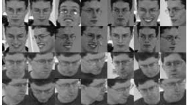
Figure 2. Some detected face images from videos of two subjects from the MoBo data set.

the test manifold, the majority voting scheme of [9, 13] was used.