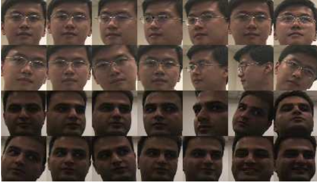
Figure 1. Some detected face images from videos of two subjects from the Honda/UCSD data set.