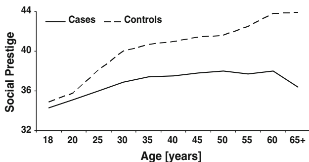
Fig. 2 Development of mean value of social prestige for cases and controls according to age. Number of cases from 18 to 65+ were 1,318, 1,444, 1,688, 1,746, 1,741, 1,702, 1,585, 1,337, 971, 518, 183, and number of controls 1,078, 1,224, 1,453, 1,533, 1,531, 1,496, 1,400, 1,209, 907, 520, 212

* Categories chosen for an equal frequency of occupations within scaling points L = 14–33, M = 34–45, H = 46–78