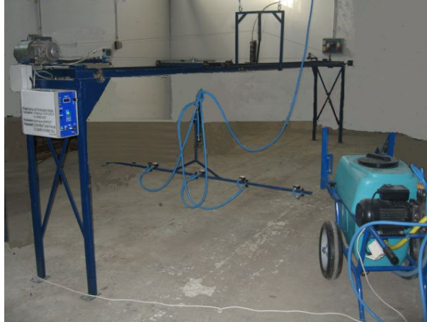
Figure 2. Mobile boom built to measure deposit under the weeds.

1.3. Deposits under the plants. To evaluate the deposits on the ground under the weeds, a mobile boom was built as shown in Figure 2. The boom can be moved along 6m rails with velocity varying between 3 to 10 km/h. Boom height and feed pressure can be adapted .