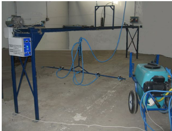
Figure 2. Mobile boom built to measure deposit under the weeds.

1.3. Deposits under the plants. To evaluate the deposits on the ground under the weeds, a mobile boom was built as shown in Figure 2. The boom can be moved along 6m rails with velocity varying between 3 to 10 km/h. Boom height and feed pressure can be adapted .