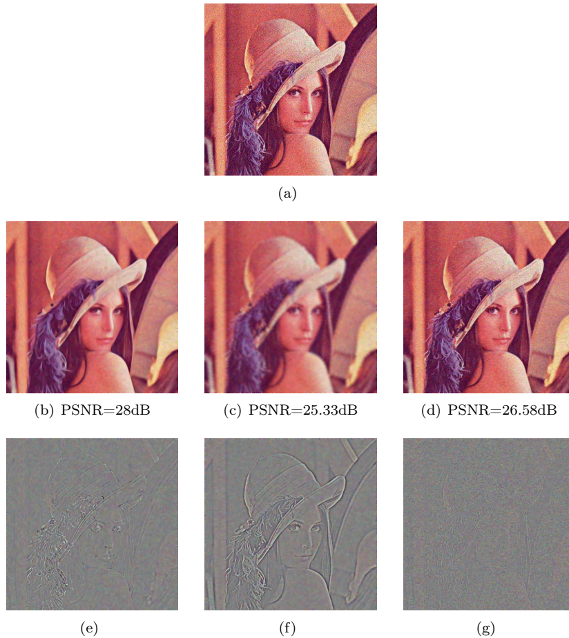
Figure 3: (a) Original picture corrupted with a gaussian Noise; (b), (c) and (d) are the filtered picture with the anisotropic diffusion proposed by Tschumperlé [71]: \mathbf{T} = c_1 \mathbf{u}\mathbf{u}^T + c_2 \mathbf{v}\mathbf{v}^T ; (b) c_1 = 0 and c_2 = 1 , Mean curvature flow; (c) c_1 = 1 and c_2 = 0 ; (d) c_i are function of the eigen values, respectively. The last row shows the residual picture (difference between original picture uncorrupted by noise and the filtered picture).