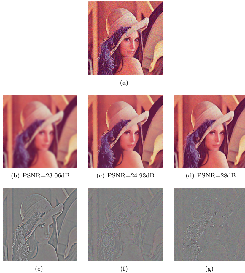
Figure 2: (a) Original picture corrupted with a gaussian Noise; (b), (c) and (d) are the filtered picture with a linear isotropic diffusion, a non linear isotropic diffusion (Charbonnier diffusivity function \lambda^2 = 0.01 ) and the anisotropic diffusion proposed by Tschumperlé [71], respectively. The last row shows the residual picture (difference between original picture uncorrupted by noise and the filtered picture).