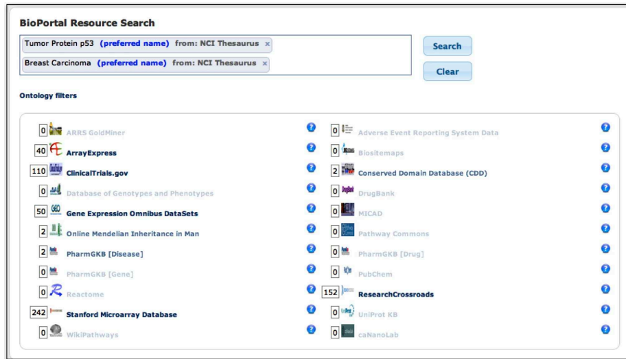
Fig. 2. The search for resources that contain both “Tumor Protein p53” AND “Breast Carcinoma.”

the physiology of the outcome. Thus, the user has satisfied her goal: she learned more about the genetic basis for strokes, some treatments, and outcomes.