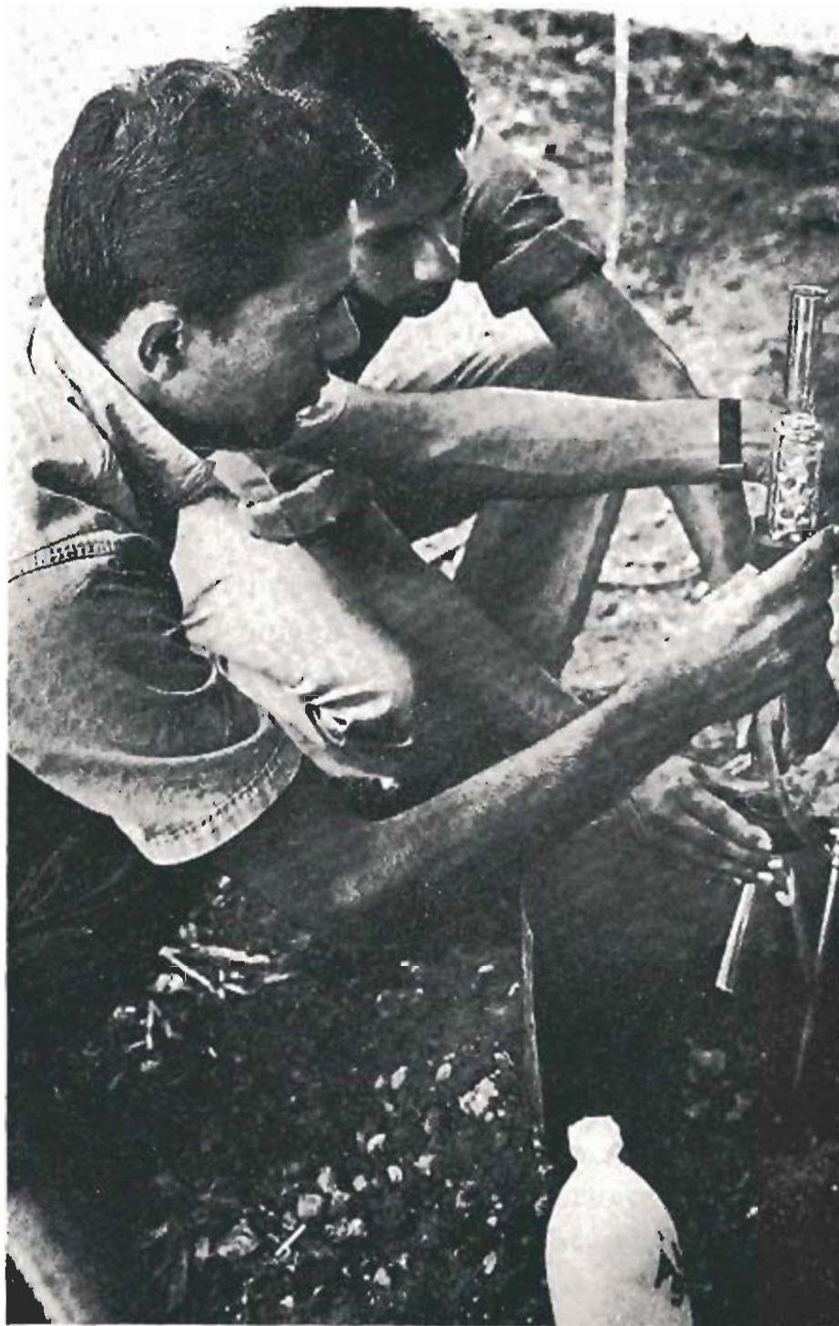
FIG. 3. Students of the University of Sri Lanka processing food samples in boiling alcohol, at the Polonnaruwa Field Station. Water for cooling the condenser is in a canvas water-carrier hanging above the apparatus.

time to dry such as large flowers and leaves. In these dried samples, sucrose was missing, probably because rapid fermentations occurred at the beginning of the drying process; glucose, fructose and other glucids of small molecular size were found in larger amounts.