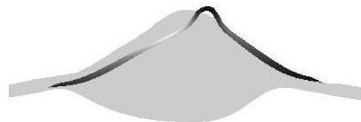
Figure 2. The deformed shape of the fibrous cap at systole (colorbar figures the stress level, from minimum=black to maximum=white) and the plaque deform shape at diastole in uniform grey.