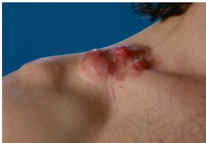
Figure 1. Dermatofibrosarcoma protuberans manifesting as an irregular red plaque on the right shoulder.