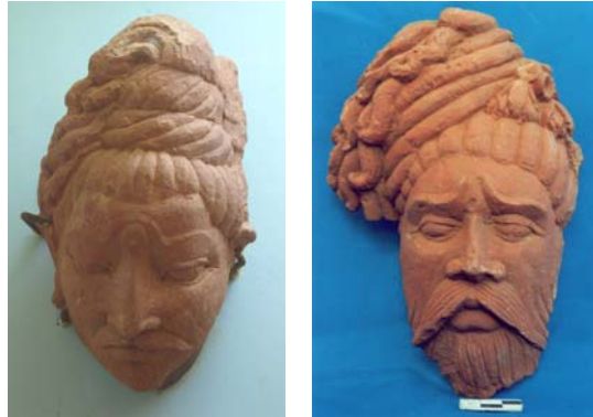
Figs 22-23 (S14 & 13)

tied together and curled up together in a spiral out of which ringlets fall down. See Fig. 22. Flowers, in this case utpalas , can be attached to the lower part of the jaṭā , enhancing the link to Śiva, see Fig. 23. Also S63 (damaged).