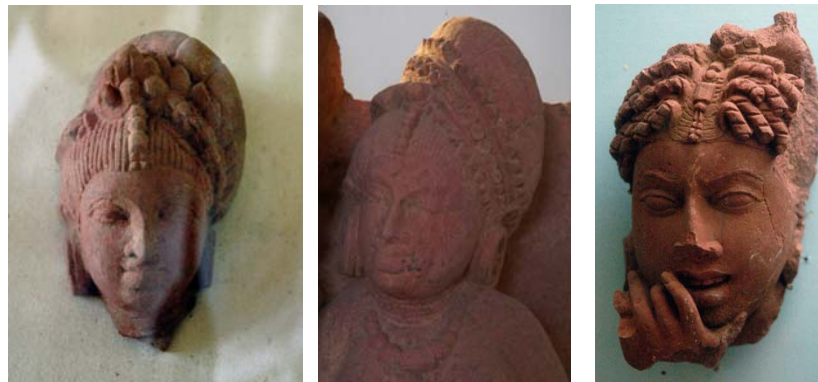
Figs 8-9 (S29 & S1)

2. The front part of the hair is flat, with all hair drawn backwards. The central jewelled ornament is attached to the elaborated flowered diadem which surrounds the bun. Figs 8-9.