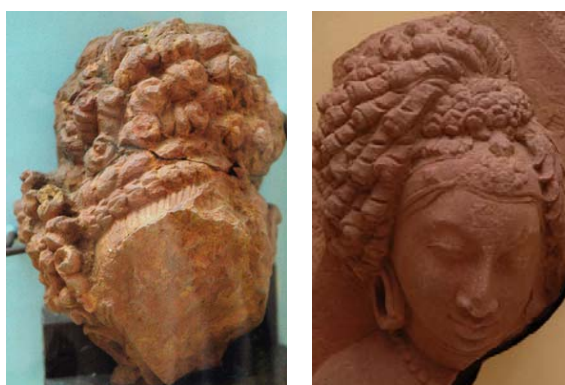
Figs 20-21 (S52 & S6)

The spiralling lock can be here hidden by a band of flowers and pointed leaves from where can fall an utpala . A row of thick pearls forms a diadem put above the hairline. See Fig. 11. The same is observed on Fig. 21 but a long pointed leaf falls from below the jaṭā in the opposite direction and a further flower, perhaps an utpala , also lies above the head, partly hidden by the bun of hair; the diadem is here broad and plain but supports the triangular fleuron. On Fig. 5, the triangular fleuron mentioned above is carved above the lower part of the matted hair. See also Fig. 20 (damaged).