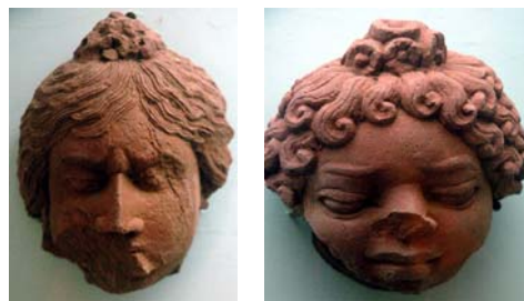
Figs 24-25 (S16 & 20)

8. Some heads belonging most probably to human or divine ‘attendants’ present a rather different type of coiffure: an ornamental item, showing a band adorned with tiny flowers, is put on the top of the head. The hair spreads all around it, either in thin locks showing a waving line or in thick and short curls. See Figs 24 and 25 (also in BAKKER 2004, pls 6.19-20).