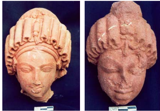
Figs 6-7 (S26 & S28)

c. A cloth can replace the neatly carved hair-locks. The circular bun is preserved at the back of the head but the front part is completely covered with two flat layers of cloth (Fig. 6) above which the pleated cloth spreads in two symmetrical parts separated by the bejewelled pendant which is attached to a fleuron lying against the bun. A row of pointed leaves forms a ring around the bun, replacing thus the elaborated diadem with tiny flowers mentioned above. See Figs 6-7.