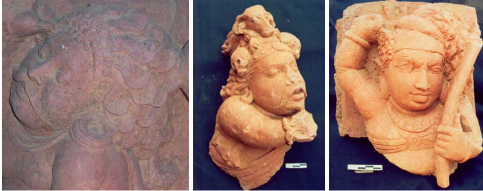
Fig. 28 (S30, left character)

plain curls all spread out (Fig. 28 & S31); a similar hair-dressing is observed at Mandasor (HARLE 1974, pl. 101).