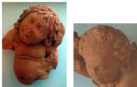
Figs 26-27 (S37 & S38)

9. Small and bulky male characters that are probably the gaṇas who belong to Śiva’s surrounding present hair-dresses which are peculiar to them. Two broad types can be distinguished, the first one reproducing the jaṭāmukuta described above (6-7), see Figs 29-30, and the second one with thick short curls framing the face (S30, right character, but much damaged) or spread from the top of the head on all directions (Fig. 26) or backwards (Fig. 27).