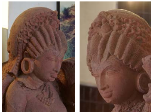
Figs 1-2 (S1)

1. The hair is regularly curled on either side of the central line, forming a continuous wave and covering the front part of the head. A large diadem of tiny flowers with strings of square beads at its extremities is set against a round and plain hair-bun which covers the back of the head. A string of thick beads which hangs from a central ornament emerging out of the flowers falls between the two parts of the curled hair. Figs 1 & 2. 2