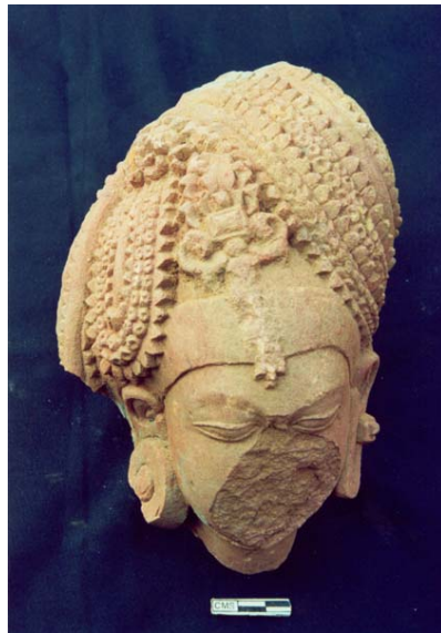
Fig. 12 (S21)