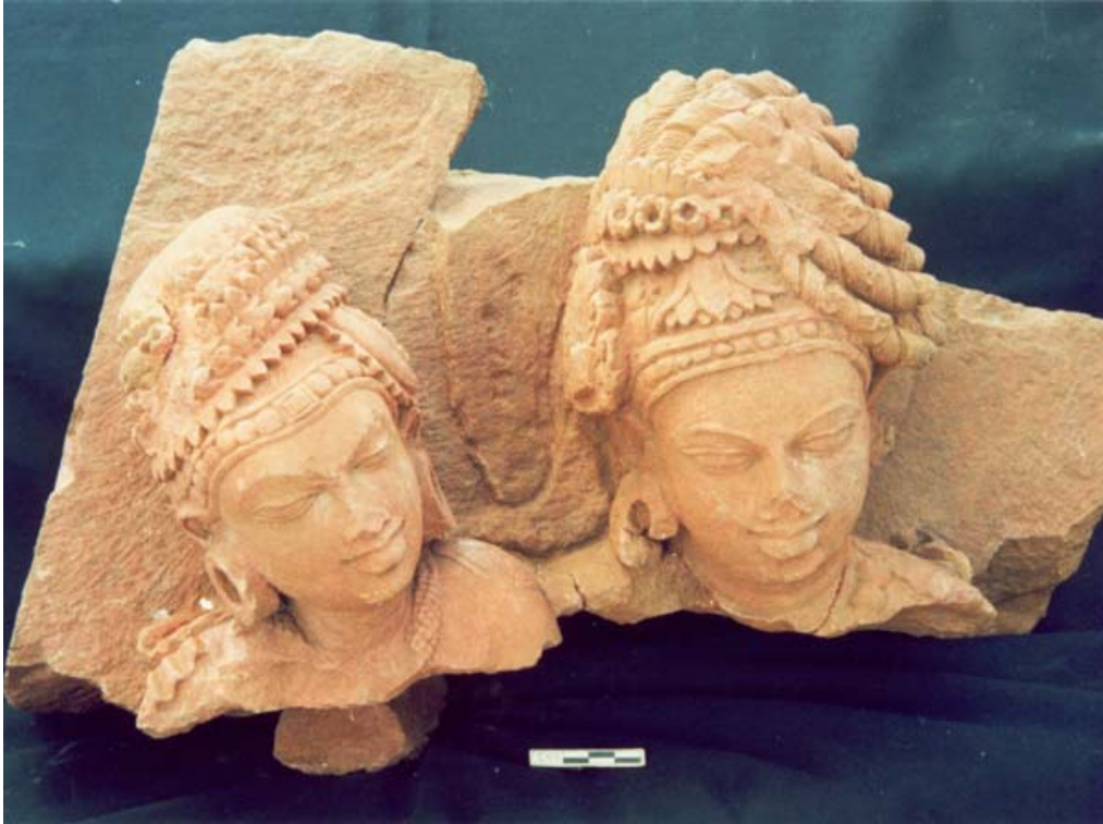
Fig. 11 (S8)