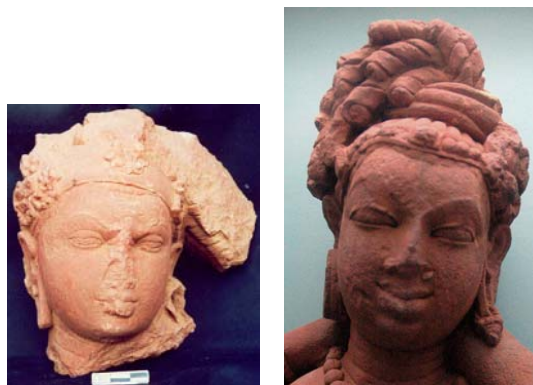
Figs 17-18 (S49 & 9)

6. The jaṭāmukūṭa . Out of the coiled up hair, thick curls fall on one side. All hair being tied together at the top of the head, the front part is flat and bears a beaded diadem with triangular fleuron on the side opposite to the falling curls. Fig. 18 (also in BAKKER 2004, pl. 6.17). See also Fig. 17 (but much damaged).