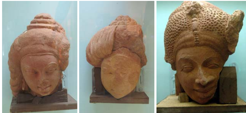
Figs 14-15 (S22 & S24)

5. A further style of a probably female coiffure should be described. The hair forms a broad band of hair framing the face, as if backcombed. All hair is drawn backwards, eventually falling on the shoulders in thick waves, and an ornamental device crowns the head. See Figs 14 & 15.