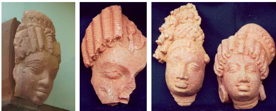
Figs 3-4 (S27 & S25)

a. The pleated hair framing the face is preserved but the elaborated diadem made of tiny flowers disappears and is replaced by one row of pointed leaves forming a ring around the bun. The central pendant still hides the middle line. Figs 3-4.