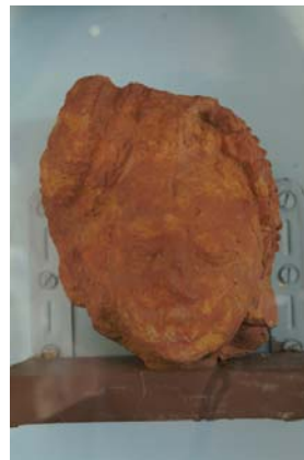
Fig. 13 (S53)

An even more gorgeous rendering of this headdress is observed on Fig. 12 where the bun is practically completely hidden by superimposed rows of flowers and leaves and where a broad garland of beads and leaves hangs opposite to it. The triangular fleuron filling the gap between the bun and the hanging garland is and