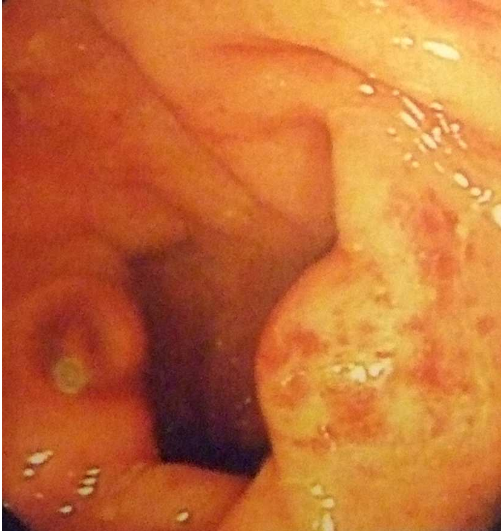
70x74mm (300 x 300 DPI)

1 2 3 4 5 6 7 8 9 10 11 12 13 14 15 16 17 18 19 20 21 22 23 24 25 26 27 28 29 30 31 32 33 34 35 36 37 38 39 40 41 42 43 44 45 46 47 48 49 50 51 52 53 54 55 56 57 58 59 60