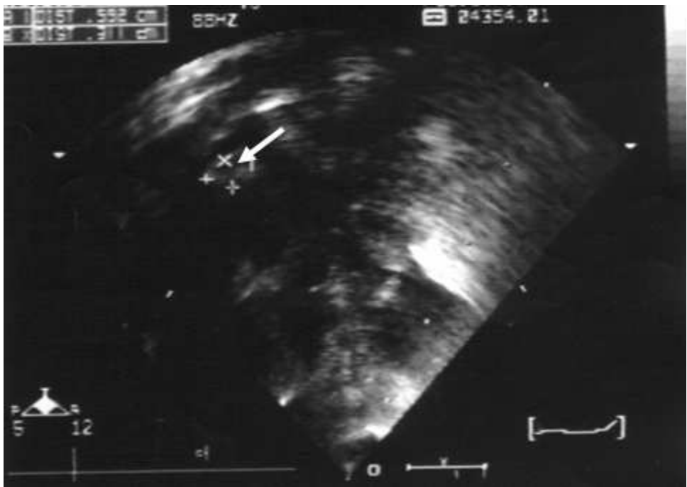
Four chamber echocardiogram view demonstrating SVC thrombus (arrow)

1 2 3 4 5 6 7 8 9 10 11 12 13 14 15 16 17 18 19 20 21 22 23 24 25 26 27 28 29 30 31 32 33 34 35 36 37 38 39 40 41 42 43 44 45 46 47 48 49 50 51 52 53 54 55 56 57 58 59 60