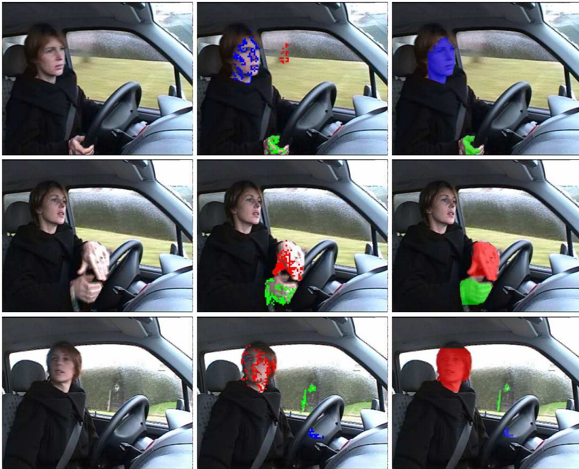
Figure 3. Car driver sequence. Frames 16, 41, 72. See text for details.