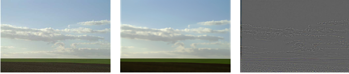
Figure 1: Result of the structure/texture decomposition algorithm from (Vese and Osher, 2003). The first column shows the original image, the second column the structure image, and finally the last one the texture image.