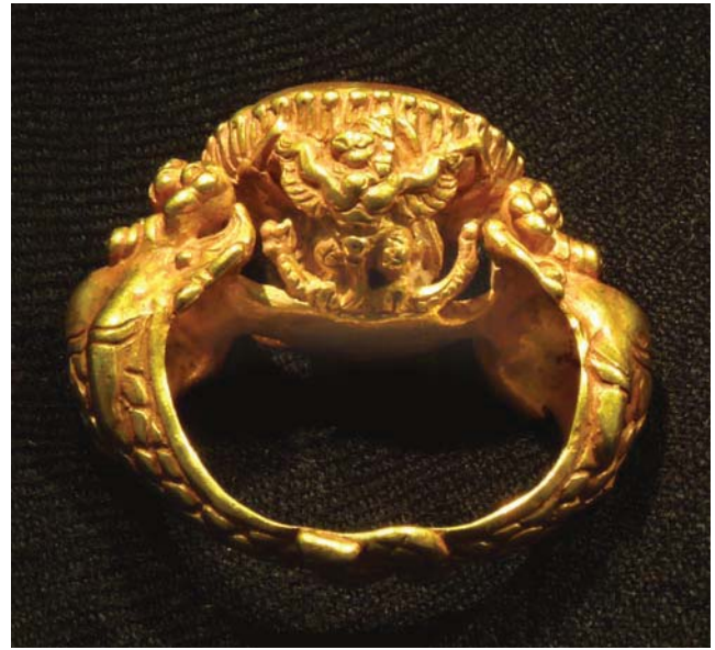
Fig. 12 Ring. Private collection

be integrated in the roundels adorning the vedikā of Amaravati whereas at Nagarjunakonda, as observed by Gilberte de CORAL-RÉMUSAT, they are part of a horizontal band which used to adorn the upper crossbeam of a vedikā and can be dated in the late third or fourth century. 14) Quite correctly, the authoress related this early representation to the proper, but later, makara -arch found in the Buddhist sites of Maharashtra from the late fifth to sixth century, a region where the source of the Khmer makara -arch partly lies.