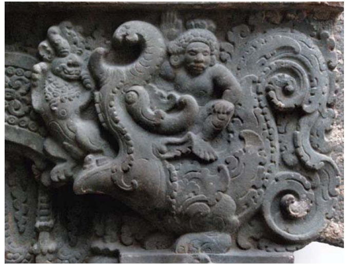
Fig. 19 Detail of Fig. 13

emerging out of the makara 's open mouth, 28) a motif generalized in the lintel surmounting niches and doors in Cālukya shrines. 29)