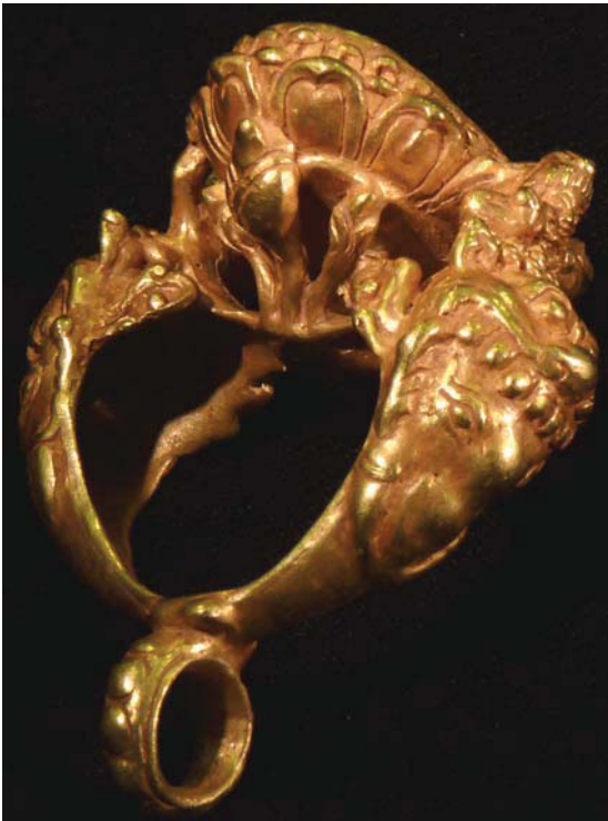
Fig. 10 Ring or pendant. Private collection

loop” technique) (Fig. 2). 8) As to their buckles, a technical analysis reveals that the main frontal was produced using the lost-wax technique 9) and thus not hammered as most gold jewellery and as the back plate adorned with a floral motif in repoussé have been (Figs. 5, 7). A proper study of the pendants (Fig. 10) reveals that they might originally have been rings like the one in Fig. 12 to which a smaller ring would have been soldered at a later period, endowing the object with a new identity: As a matter of fact, the complete iconography of these “pendants” gets its full value when the object is held with the stone above and not below as in the case of pendants.