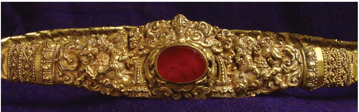
Fig. 6 Detail of Fig. 1