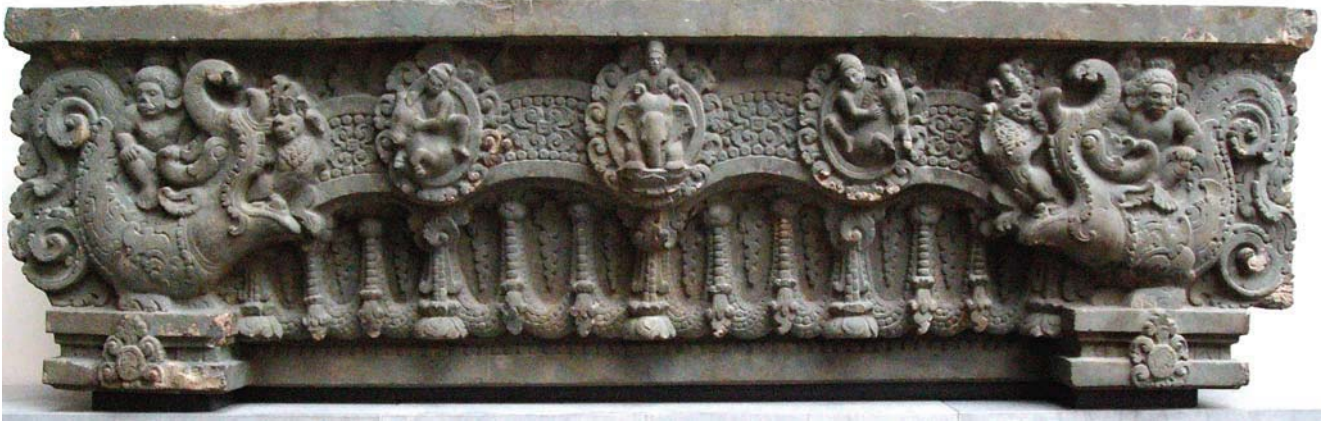
Fig. 13 Lintel from Sambor Prei Kuk. Musée Guimet, Paris