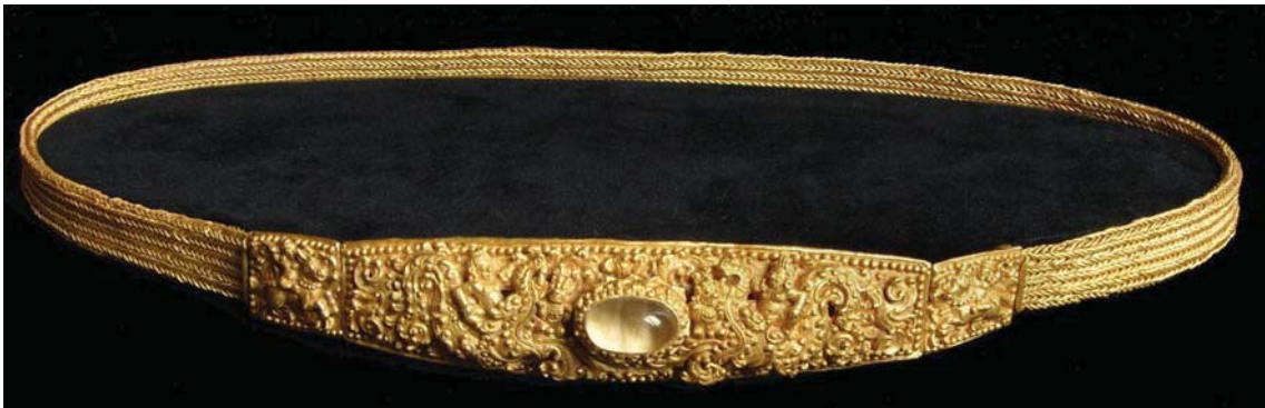
Fig. 2 Girdle. Private collection