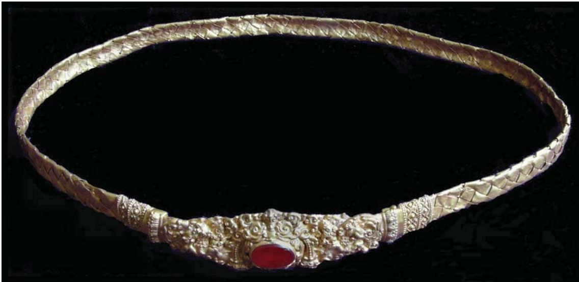
Fig. 1 Girdle. Private collection