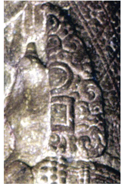
Fig. 17 Crown of Harihara. Badami, Cave 3

(Fig. 9): A similar composition is encountered at the seventh-century Saṅgameśvara temple which used to stand at Kudavelli Saṅgam (Fig. 21), 22) where a beaded oval medallion adorned with a flower is inserted within a frame of short foliated scrolls, all lying in the slightly curved line formed by the two bodies of divergent makar - ras ' heads. This part of the ornament, i.e. the two divergent makar - ras ' heads, traces its origin back to Nagarjunakonda from where it enters Pallava art, being seen in the lintels of the Dalavanur cave and the Draupadīratha in Mamallapuram. 23) As such also, the two makar - ras are also integrated in the head ornament worn by north Indian