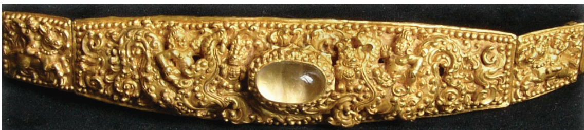
Fig. 3 Detail of Fig. 2