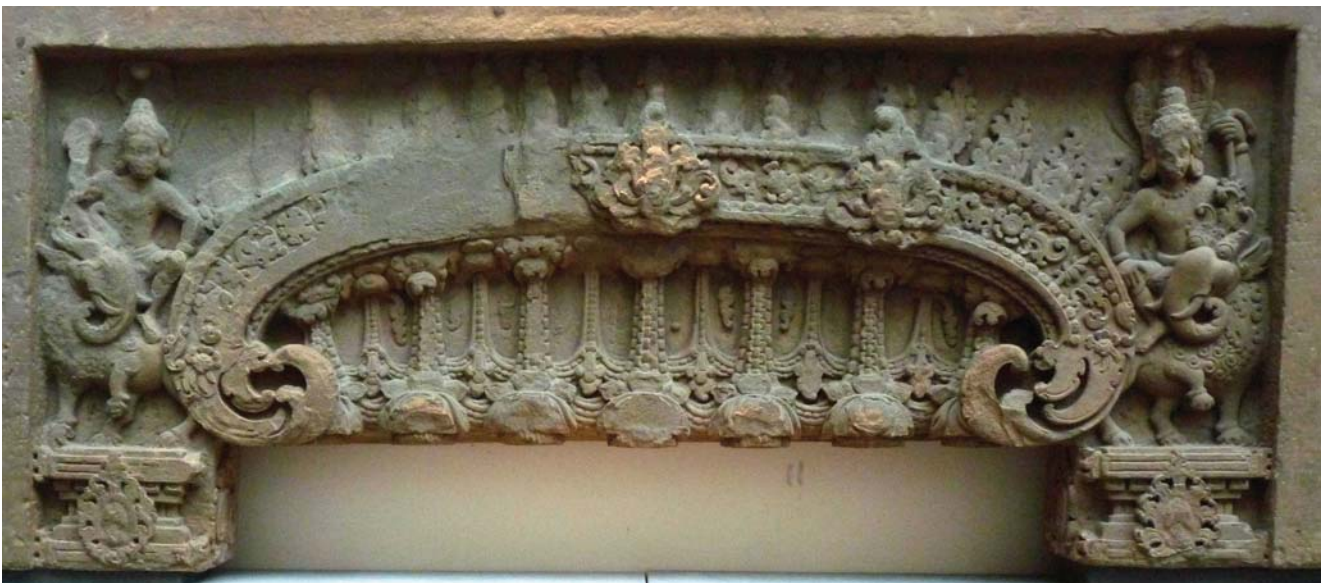
Fig. 14 Lintel from Prasat Prei Kmeng. Musée Guimet, Paris

will then occur in pre-Angkorian architecture in the seventh century, a relationship which has been recognized and studied in detail by French scholars. 19)