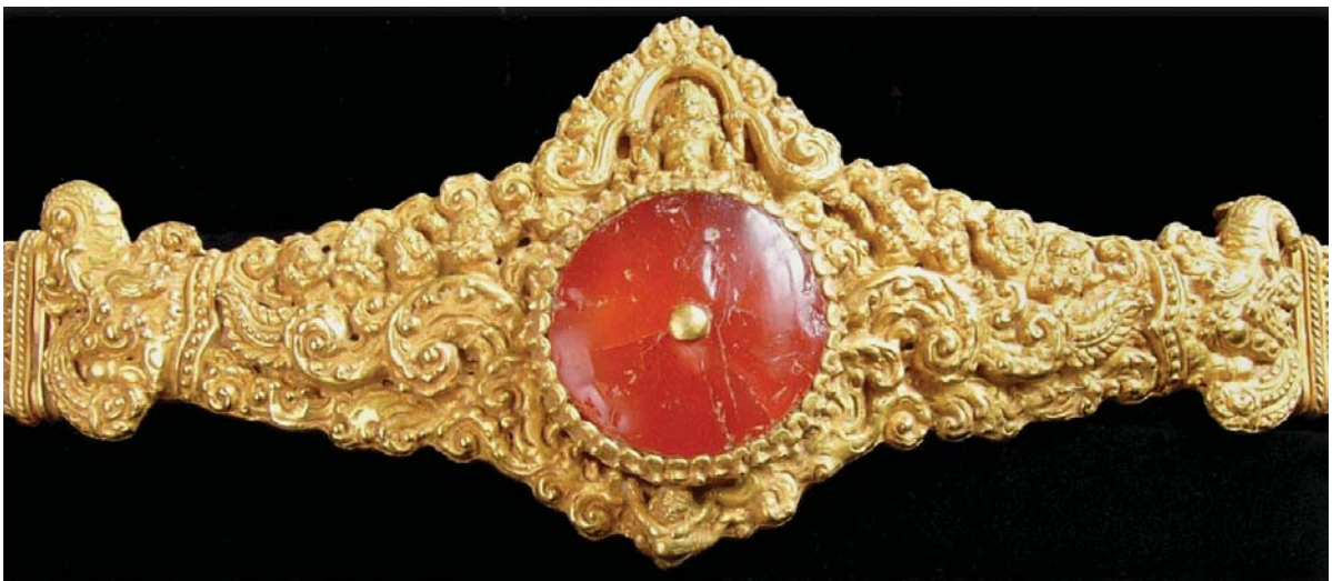
Fig. 8 Detail of girdle. Private collection