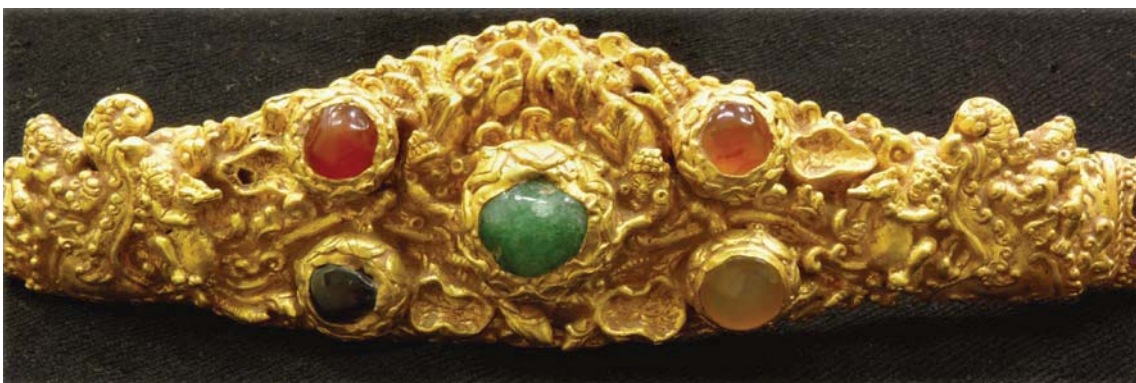
Fig. 4 Detail of Girdle. Private collection