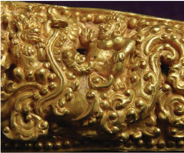
Fig. 18 Detail of Fig. 1