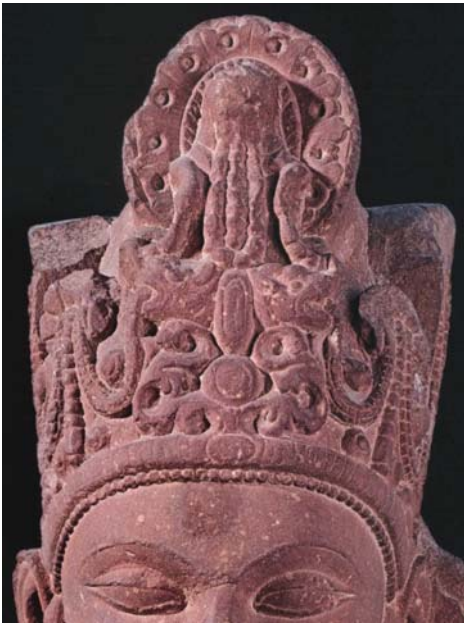
Fig. 15 Crown of Viṣṇu from Mathura. National Museum, New Delhi