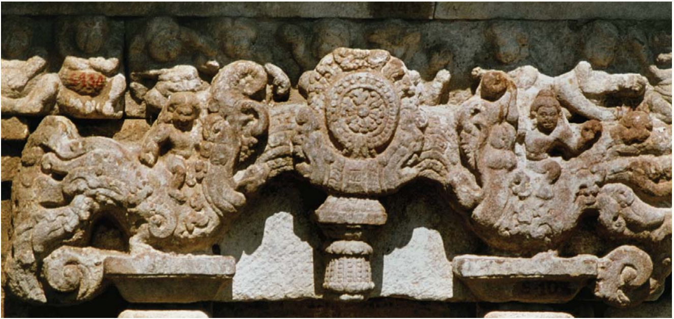
Fig. 21 Lintel in the Saṅgameśvara temple, Kudavelli, Andhra Pradesh

Atharva Veda and the Mahābhārata , e.g., and this bright bow is also said to be adorned with numerous gems in the Saundaryalaharī by Śaṅkara (verse 40); 41) further, Indra is the god of rains. 42)