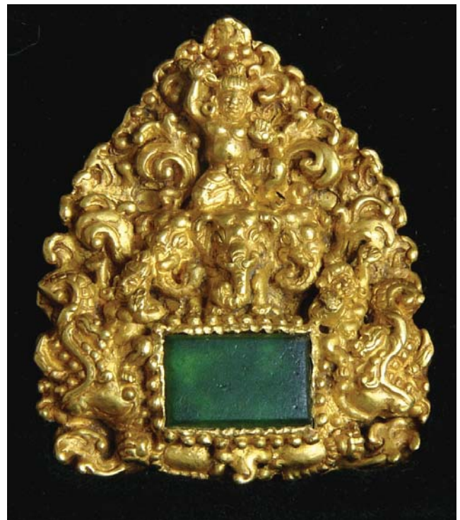
Fig. 9 Head-clasp. Private collection

The deep symbolic functions which these jewels reflect cannot, however, let us forget that the composition had also and mainly to be attractive. Arrangements such as the ones seen on the girdles illustrated here ( Figs. 1-8 ) were moreover also encountered in South Asian jewellery: Although no jewel similar to those discovered in Southeast Asia has been recovered in India, their existence is attested through their presence in images of gods