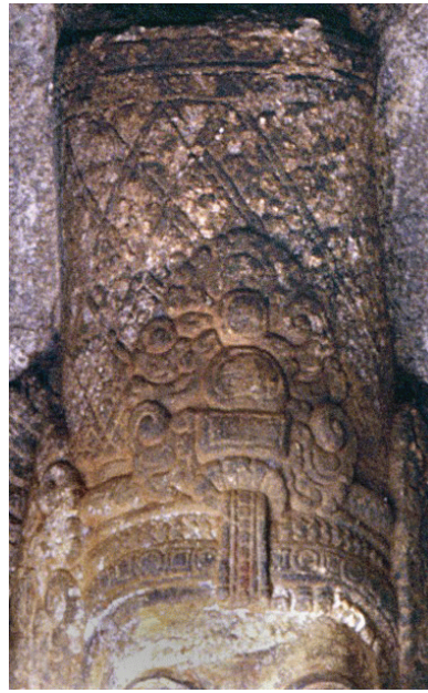
Fig. 16 Crown of Viṣṇu. Badami, Cave 3