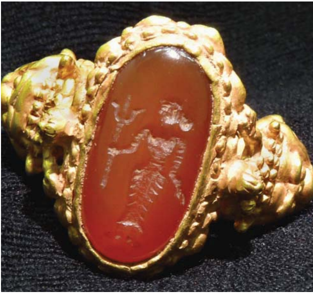
Fig. 11 Ring or pendant. Private collection