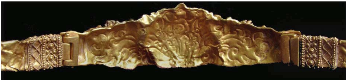
Fig. 7 Detail of inner side of Fig. 6