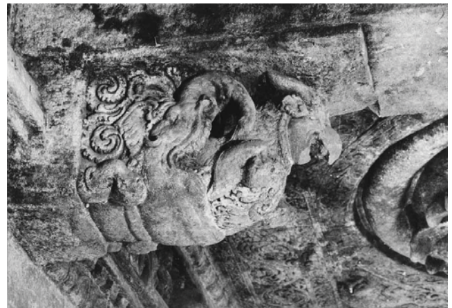
Fig. 20 Detail of bracket in Badami, Cave 1

Moreover, a closer look at this part of the monument which surmounts the entrance allows a better interpretation of the symbolic value of the jewels. As a matter of fact, it has more than one meaning and function: 35) It shows to which deity the monument is dedicated, which deity lives and is worshipped therein, and it includes motifs with a deep symbolic significance which helps to define the nature of the divine world at the same time that it contributes to convey a new perception of ‘what’ is indeed the monument, making it ‘religious’ in relating it simultaneously to the human and to the divine world. It also simultaneously displays a propitious and apotropaic function assumed by the presence of vegetation and fantastic animal motifs, mainly the pair of makaras . The makaras are depicted as convergent in the pre-Angkorian period, a position which betrays a strong propitious function; they swallow rows of pearls forming an elegant curve, a motif which evidently refers to their affiliation to the waters as source of life which brings forth fertility and richness. 36) But at a later period, the ninth century, these fantastic water creatures diverge 37) and can eventually be replaced by nāgas , all facing the outside world and thus defend the sacred space. 38)