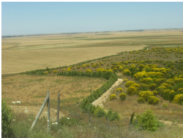
Fig. 2 Typical landscape of the study site: pseudo steppe and bushy areas

Since 1996, hunting and agricultural management policies were carried out. Hunting was not allowed and a minimum legal control of predators was carried out: