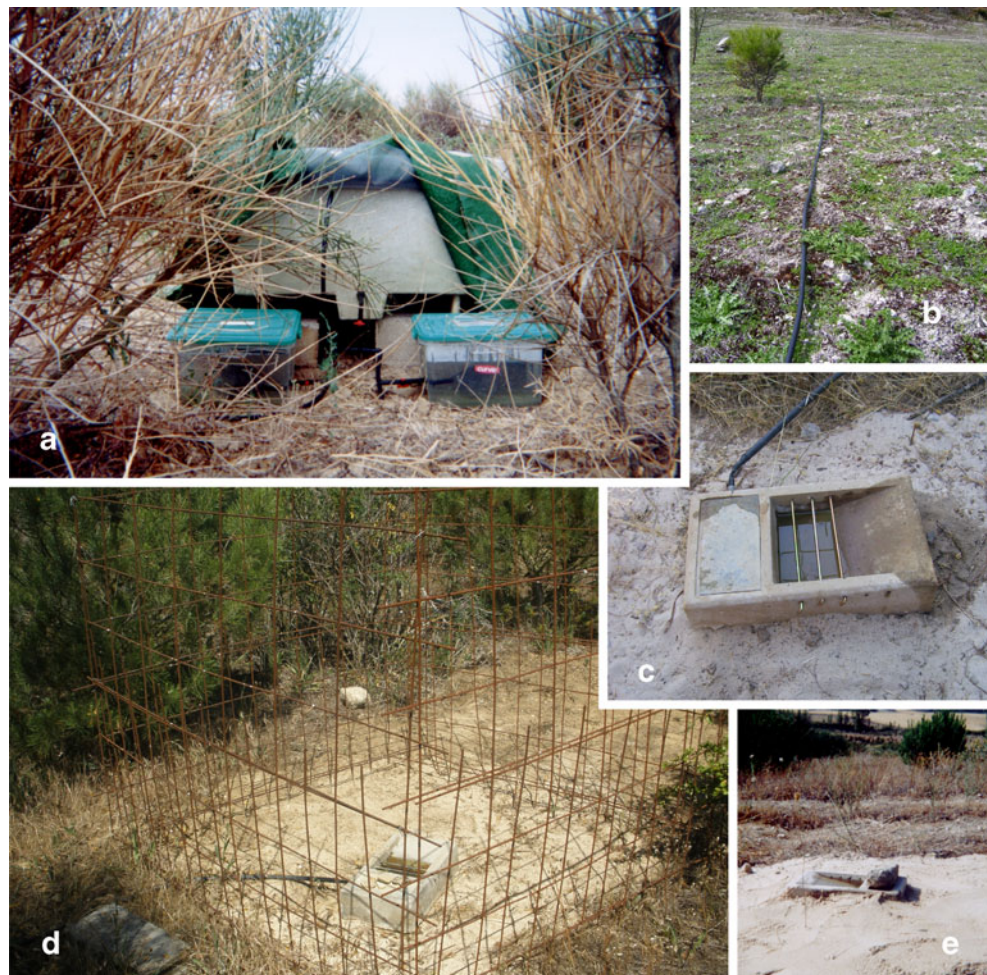
Fig. 3 Water trough device: a main water tank and measuring tanks, b plastic pipe, c water trough and escape metal bars, d protected trough with fence (2004–2005), and e open trough without fence (2002–2003)