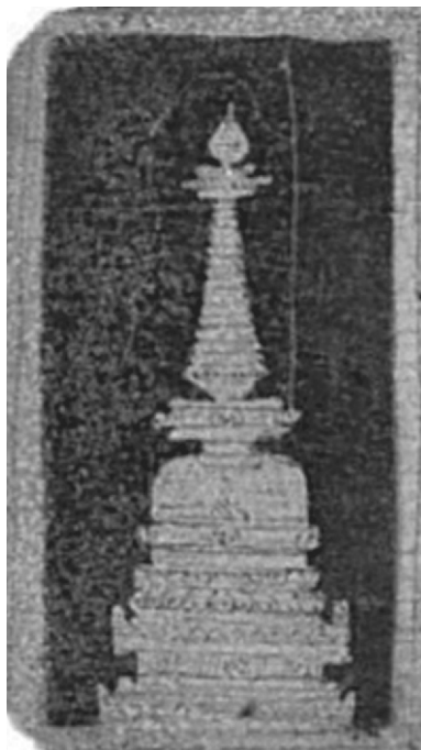
Fig. 5 Left margin of folio with Fig. 3.

Samantabhadra is a Bodhisattva who is extremely rarely depicted in India. He sits on the elephant which is his vehicle, displays the gesture of teaching, and holds the utpala or blue lotus painted above his left shoulder. He usually forms a pair with Mañjuśrī who sits on the lion: as such, both will be preserved in the esoteric art from Central Asia up to Japan where they are commonly encountered under the names of Fugen and Monju. The concept must have arisen in India but is there rarely illustrated. A second depiction of Samantabhadra paired to Mañjuśrī is known from the book-covers of a manuscript dated in the first part of the twelfth century and preserved in the