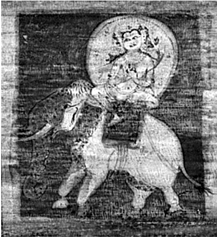
Fig. 4 Samantabhadra.

the artists retained on the whole four colours, i.e., mainly white/pinkish but also golden/yellow (as seen in a depiction of Mañjuśrī, for instance: Bautze-Picron 1999: pl. 13.37), red which is usually reserved to the depiction of Hayagrīva, 3 and, but very rarely, green used in the rendering of the (green) Tārā (Bautze-Picron 1999: pl. 13.11).