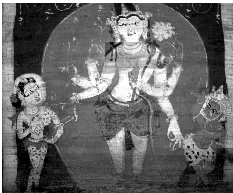
Fig. 1 Six-armed Avalokiteśvara.

Eventually, like here on Fig. 1, loops and tassels are painted white in the upper part of the field, stressing thus the importance of the character painted below them.