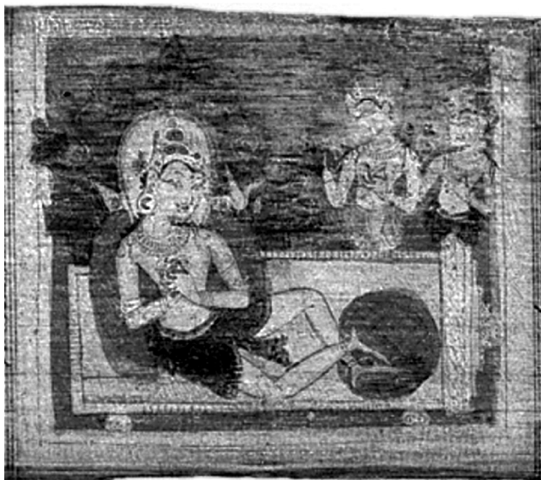
Fig. 3 Mañjuśrī attended by two further Bodhisattvas.

On the back of the representation of Avalokiteśvara, is painted a rather unconventional depiction of a rather enigmatic character. As a matter of fact, it reverses the traditional and 'correct' position and displays the gesture of generosity with the left hand while holding the utpala in the right hand. The reasons for such a radical transformation remain obscure; one could speculate about the meaning of such a reverse painting, but a 'mistake' by the artist cannot be ruled out. Moreover, and this also constitutes a feature particular to this illumination, the face is profiled and not seen from the front as it is always the case; this character bears a long skirt, as female deities do – and thus, due to the presence of the utpala , one could suggest an identification with the Tārā; however, the breast is not clearly drawn and, besides, the upper part of the body is bare, which is never the case as far as female deities are concerned – and thus, one could likewise suggest to recognize here Mañjuśrī. Also the colour of the carnation, here golden or yellow cannot be considered to be a decisive factor: