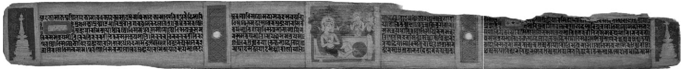
Fig. 7 The composition of folios of Harivarmadeva.

Museum of Fine Arts, Boston and a third image of this Bodhisattva is illustrated in a Nepali manuscript dated AD 1015 where it is said to be located in China (Foucher 1900: 120-121, pl. VI.2). 4 From the Boston example, one could conclude that the Harivarmadeva manuscript might also have included a Mañjuśrī teaching and seated on the lion who must have been paired with this Samantabhadra, unless the image represents also such a 'famous' image of the Buddhist world, a topic which has been present in the murals of central Asia and in the manuscripts from Eastern India: this topic constitutes practically a geography of the major Buddhist sites in Asia in putting together images which are worshipped in those sites. The Nepali manuscript mentioned above give the name of the deities who are illustrated as well as the place where their images are being worshipped. This is not the case here, but the diversity of the deities to be depicted could imply that such a program was here illustrated all through the manuscript.