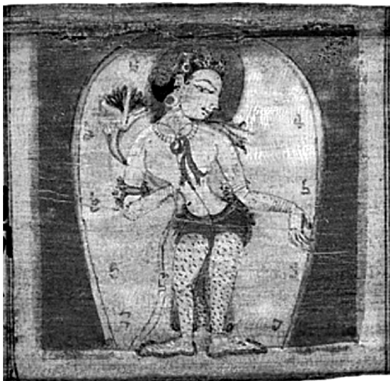
Fig. 2 Avalokiteśvara making the gesture of generosity with his left hand and holding the utpala in the right hand.