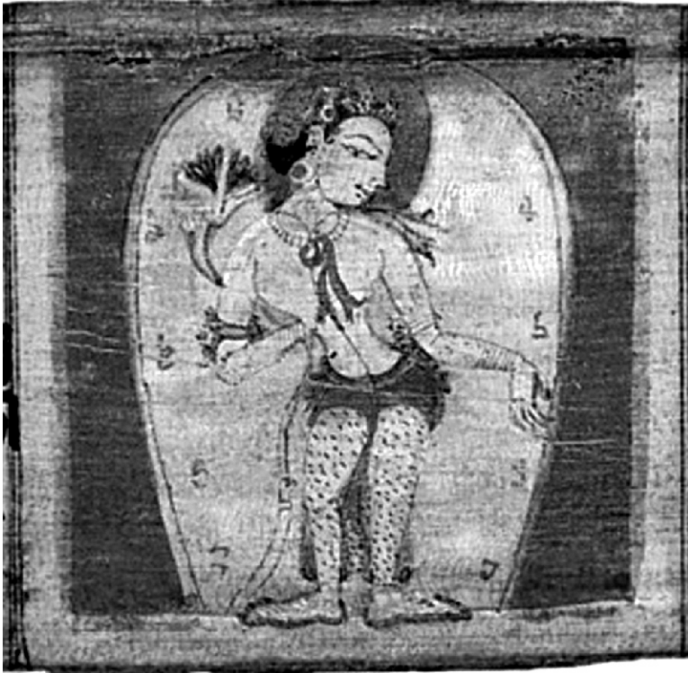
Fig. 2 Avalokiteśvara making the gesture of generosity with his left hand and holding the utpala in the right hand.