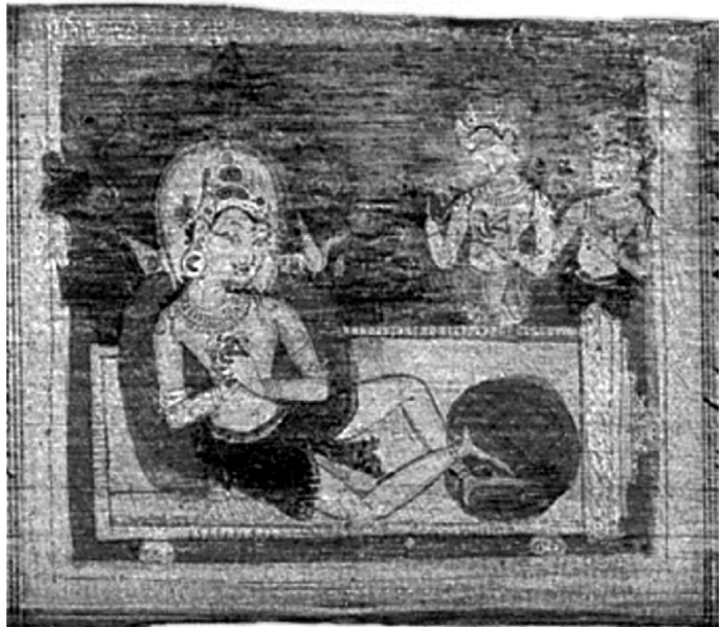
Fig. 3 Mañjuśrī attended by two further Bodhisattvas.

On the back of the representation of Avalokiteśvara, is painted a rather unconventional depiction of a rather enigmatic character. As a matter of fact, it reverses the traditional and 'correct' position and displays the gesture of generosity with the left hand while holding the utpala in the right hand. The reasons for such a radical transformation remain obscure; one could speculate about the meaning of such a reverse painting, but a 'mistake' by the artist cannot be ruled out. Moreover, and this also constitutes a feature particular to this illumination, the face is profiled and not seen from the front as it is always the case; this character bears a long skirt, as female deities do – and thus, due to the presence of the utpala , one could suggest an identification with the Tārā; however, the breast is not clearly drawn and, besides, the upper part of the body is bare, which is never the case as far as female deities are concerned – and thus, one could likewise suggest to recognize here Mañjuśrī. Also the colour of the carnation, here golden or yellow cannot be considered to be a decisive factor: