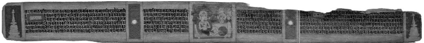
Fig. 7 The composition of folios of Harivarmadeva.

Museum of Fine Arts, Boston and a third image of this Bodhisattva is illustrated in a Nepali manuscript dated AD 1015 where it is said to be located in China (Foucher 1900: 120-121, pl. VI.2). 4 From the Boston example, one could conclude that the Harivarmadeva manuscript might also have included a Mañjuśrī teaching and seated on the lion who must have been paired with this Samantabhadra, unless the image represents also such a 'famous' image of the Buddhist world, a topic which has been present in the murals of central Asia and in the manuscripts from Eastern India: this topic constitutes practically a geography of the major Buddhist sites in Asia in putting together images which are worshipped in those sites. The Nepali manuscript mentioned above give the name of the deities who are illustrated as well as the place where their images are being worshipped. This is not the case here, but the diversity of the deities to be depicted could imply that such a program was here illustrated all through the manuscript.