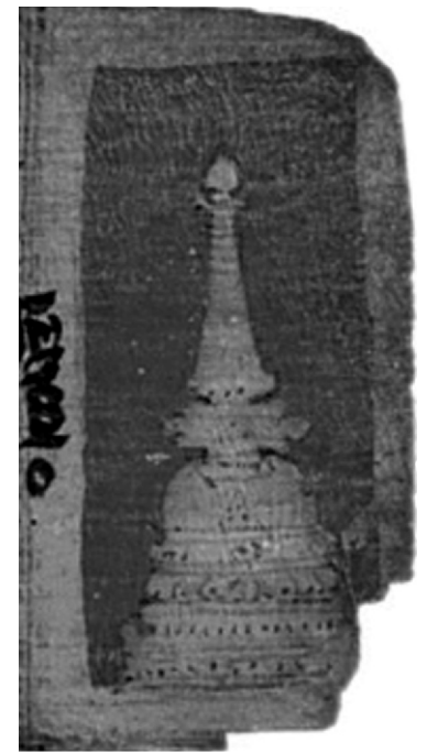
Fig. 6 Left margin of folio with Fig. 4.