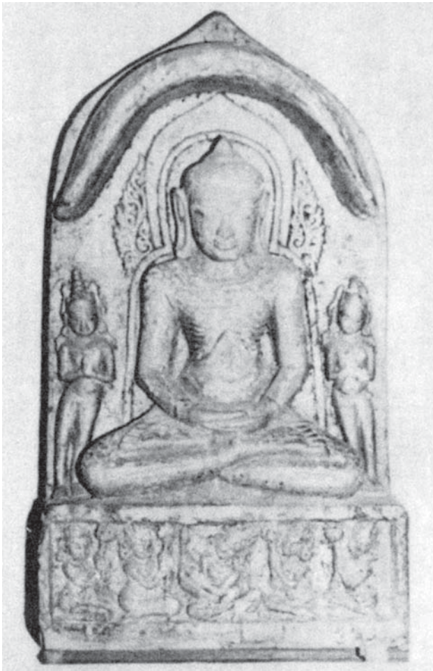
Fig. 8 – The emaciated Buddha, Pagan Museum. After Luce 1969-70, III: pl. 407d.