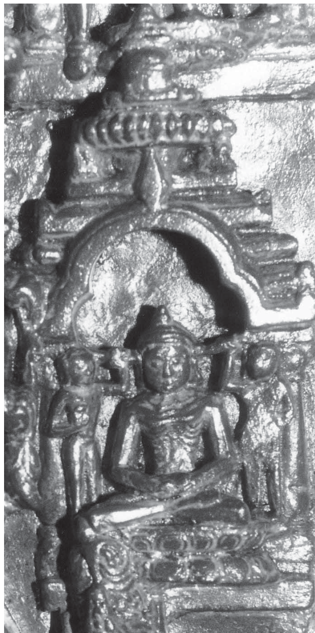
Fig. 1 – The emaciated Buddha, detail of the 'Betagi image'.