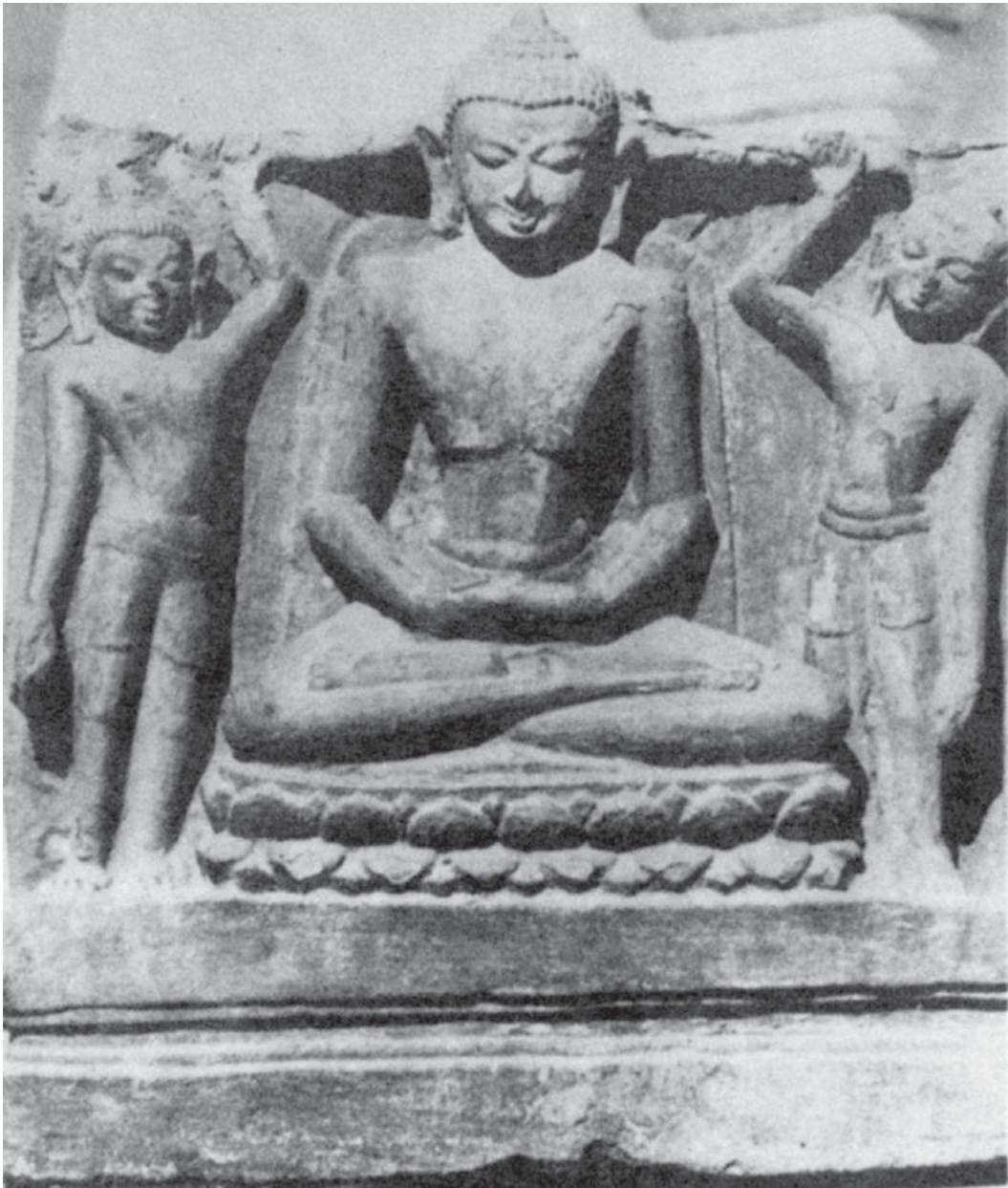
Fig. 7 – The emaciated Buddha, Ananda Temple, Pagan. After Luce 1969-70, III: pl. 318d.

I, Sutta 36; Nāṇamoli 1998: 18-19) whereas in the Paṭhamasambodhikathā , these gods ‘preserved his life, by insinuating food through the pores of his skin’ (Alabaster 1871: 138-42), the same being told in the Mālāṅkaravatthu (Edwardes 1959: 35-39; Bigandet 1880, I: 72-83). 9