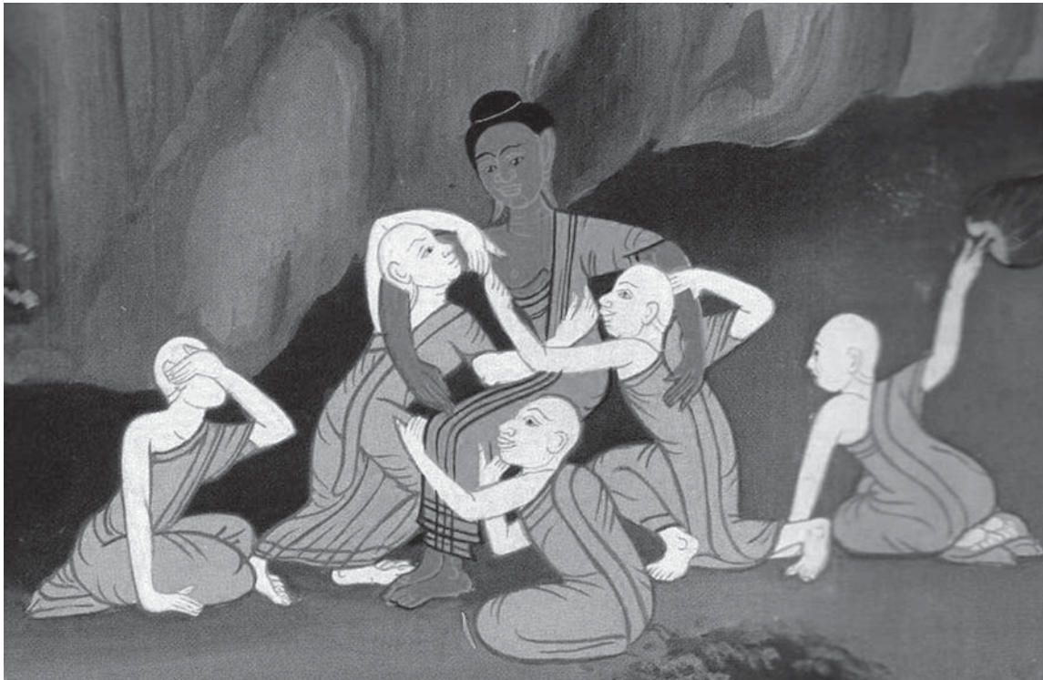
Fig. 13 – The fainting Buddha, Wat Choeng Tha, Ayutthaya. After The Life 1957: pl. 18.