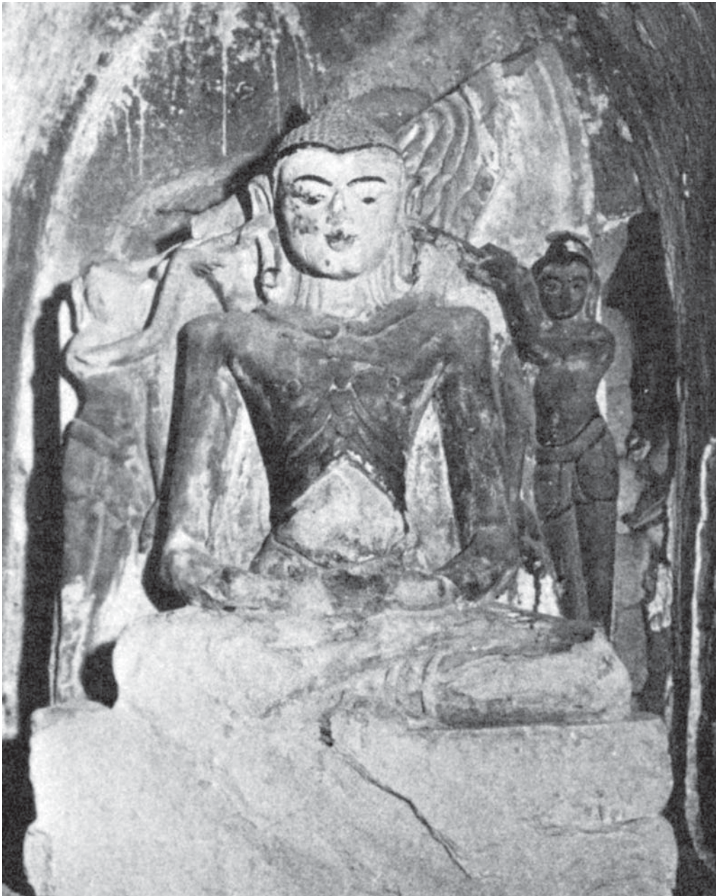
Fig. 6 – The emaciated Buddha, Kyaukku Ônhmin Temple, Pagan. After Luce 1969-70, III: pl. 141d.

the literary sources, their study conveying an understanding of the image as a way of asserting major ideas belonging to the local main stream Theravādic Buddhism.