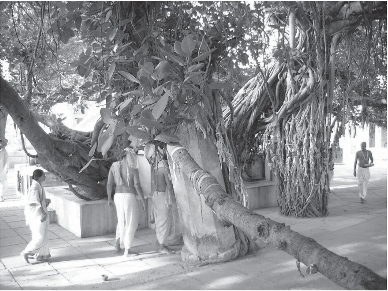
Fig. 18 – The Akṣaya-vaṭa, Gaya.