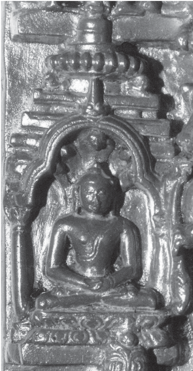
Fig. 2 – The Buddha protected by Mucilinda, detail of the ‘Betagi’ image.

Although its study can lead the way to various interpretations, this specific iconography basically remains an illustration of the six enduring years during which the future Buddha led extremely rigorous austerities after he had left Kapilavastu, cut his long hair and renounced his princely dresses. 4 The period of asceticism started so