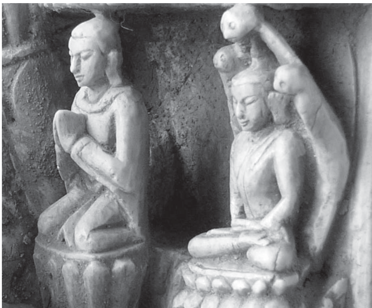
Fig. 4 – The Buddha protected by Mucilinda, detail of Fig.1 in Bautze-Picron 2006.