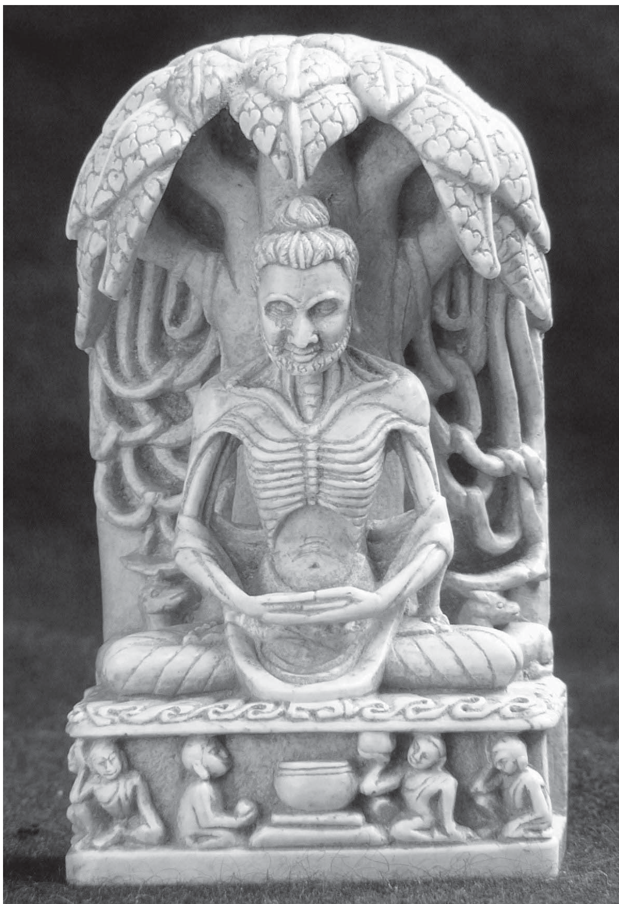
Fig. 11 – The emaciated Buddha, private collection.