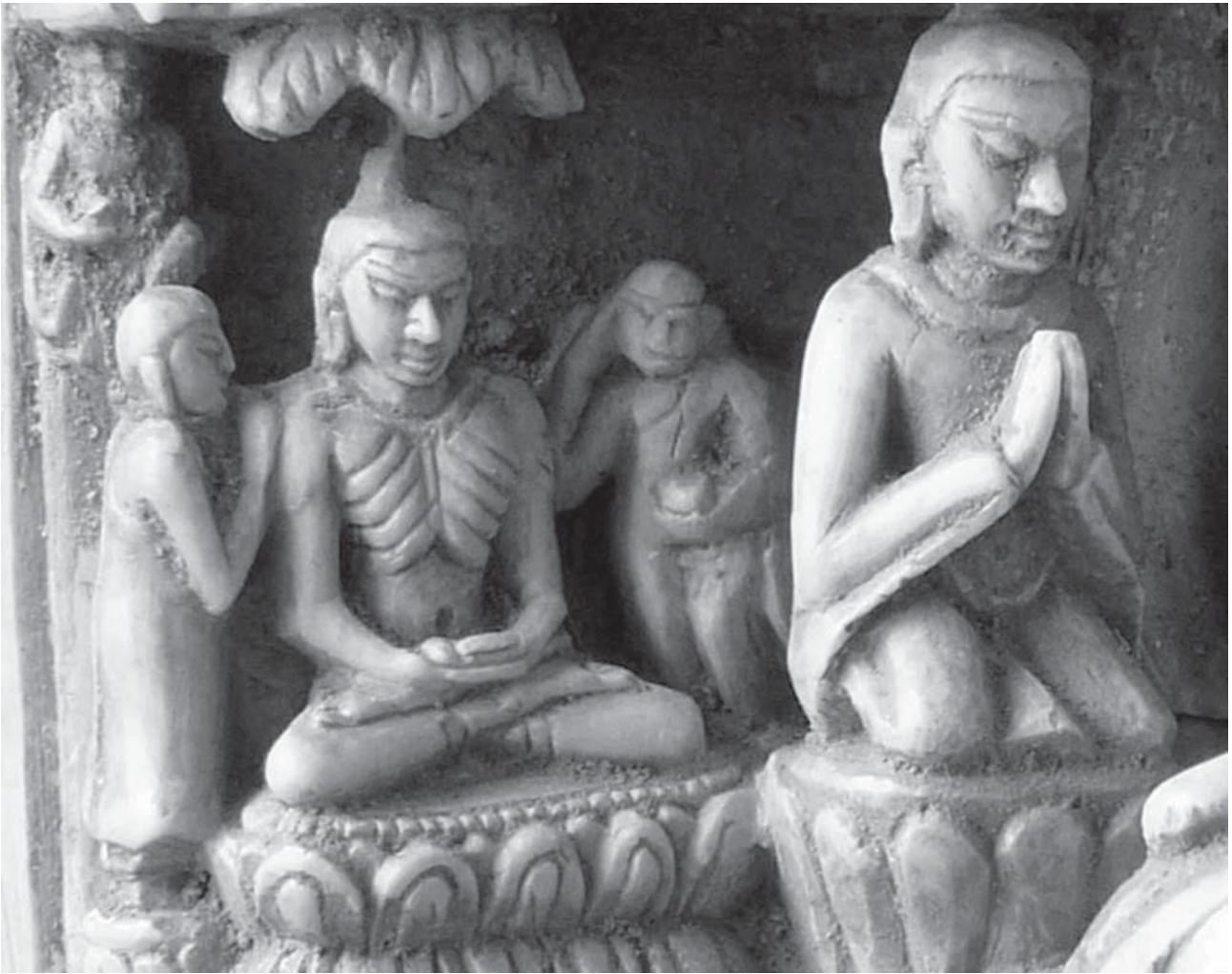
Fig. 3 – The emaciated Buddha, detail of Fig.1 in Bautze-Picron 2006.

murals of Pagan emerged. Their position within the overall ornamental structure probably reflects their place within the Buddhist community: whereas the two monks Sāriputta and Moggallāna are constantly seen, kneeling on either side of the main image of the Buddha, these ascetics are utmost rarely depicted and then only in the frame around Buddha images or in the ornamentation of windows, i.e. near the outside space (Bautze-Picron 2003: 104,108, pls 126-8).