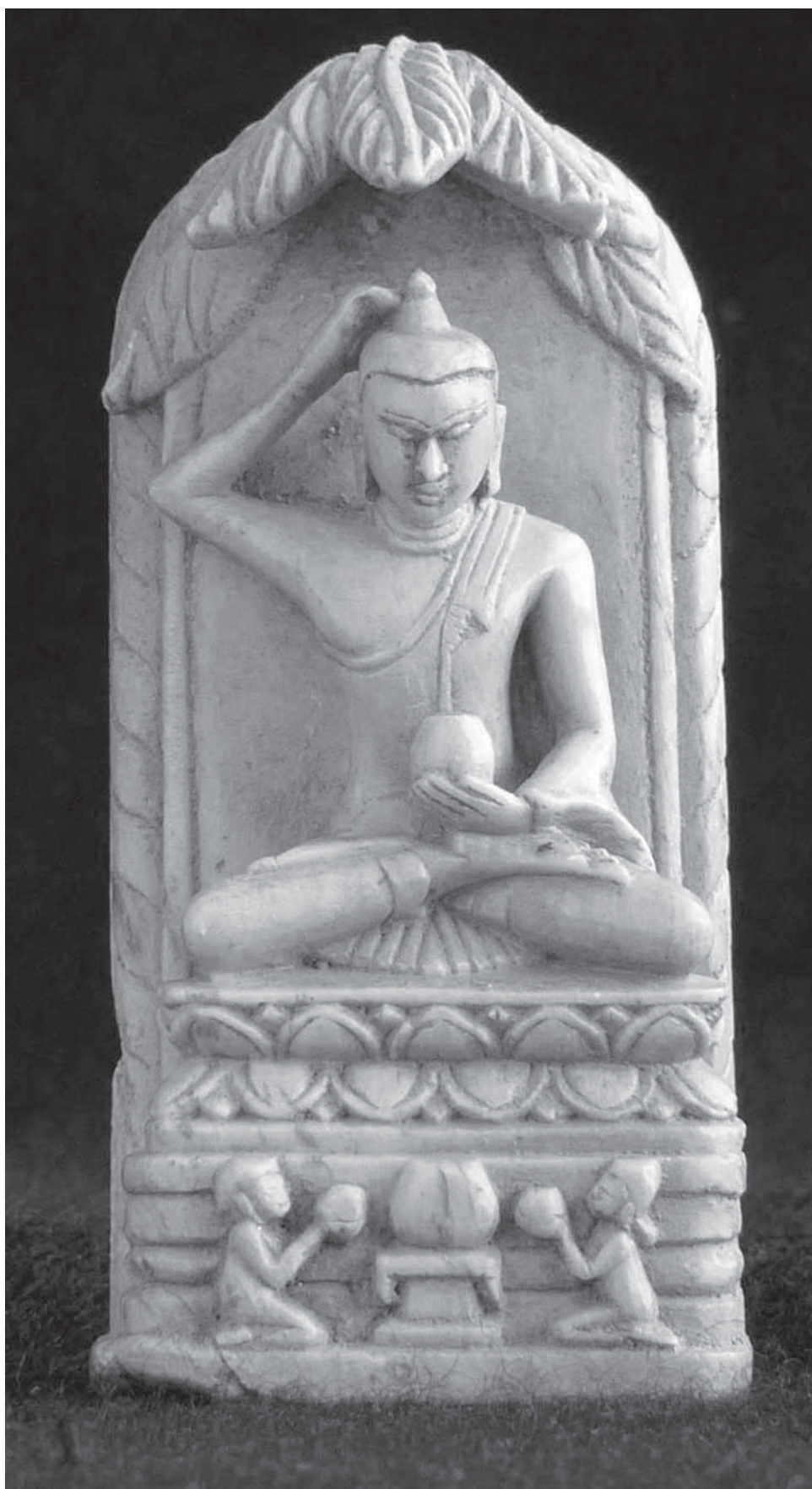
Fig. 17 – The Buddha pulling his hair, private collection.