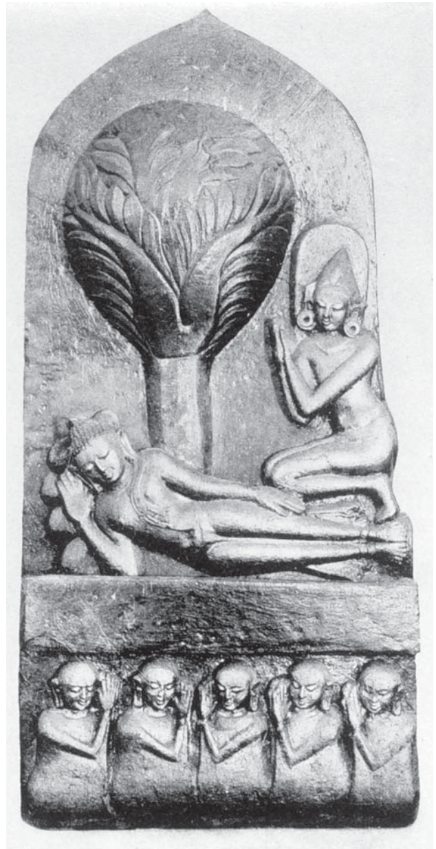
Fig. 16 – The faintest Buddha, Ananda Temple, Pagan. After Seidenstücker 1919: Abb. 60.

of the hermit one or more of these peaceful animals refer to the ascetic’s life in the forest, and that even often one or more lion can be introduced in this depiction of an idyllic peaceful life: as such, both animals are present from Sanchi to Deogarh or Mahabalipuram. And as such also, the deer occur in a small image flanking the Buddha meditating below a tree (Bautze-Picron 2006: fig. 17a-b).