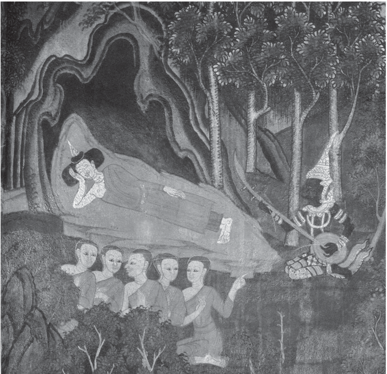
Fig. 14 – The fainted Buddha, Wat Ratchasittharam, Thonburi. After Wat 1982: 69.

Another banyan tree appears in the cycle of the Bodhi, the Buddha taking place then under the ‘tree of the Goatherd’ during the fifth or sixth week after the Enlightenment, 20 a tree which can also be related to the tree of the pre-Enlightenment period of asceticism as seen below.