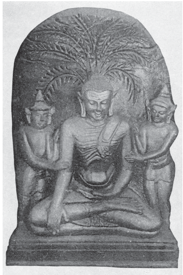
Fig. 9 – The emaciated Buddha, Ananda Temple, Pagan. After Seidenstücker 1919: Abb. 59.

the food is collected, becomes a symbol of healthy life: the presence of this attribute – the only attribute of the Buddha in fact – in the pedestal below the emaciated Buddha might illustrate the existence of an alternative to the severe austerities which the future Buddha had chosen to experiment. The Nidānakathā also underlines the fact that the future Buddha ‘went about gathering alms...’ for which the alms bowl is evidently necessary (Jayawickrama 1990: 89-93). As we know, the taking of food led to the regeneration of the future Buddha who had lost all his gleam and was even thought to be deceased (Bautze-Picron 2007a: 107); when resuming to food, the future Buddha recovered his thirty-two characteristics and the ‘golden hue’ of his body ( Nidānakathā ), and his hair grew again, as shown by Anna Maria Quagliotti in the present volume.