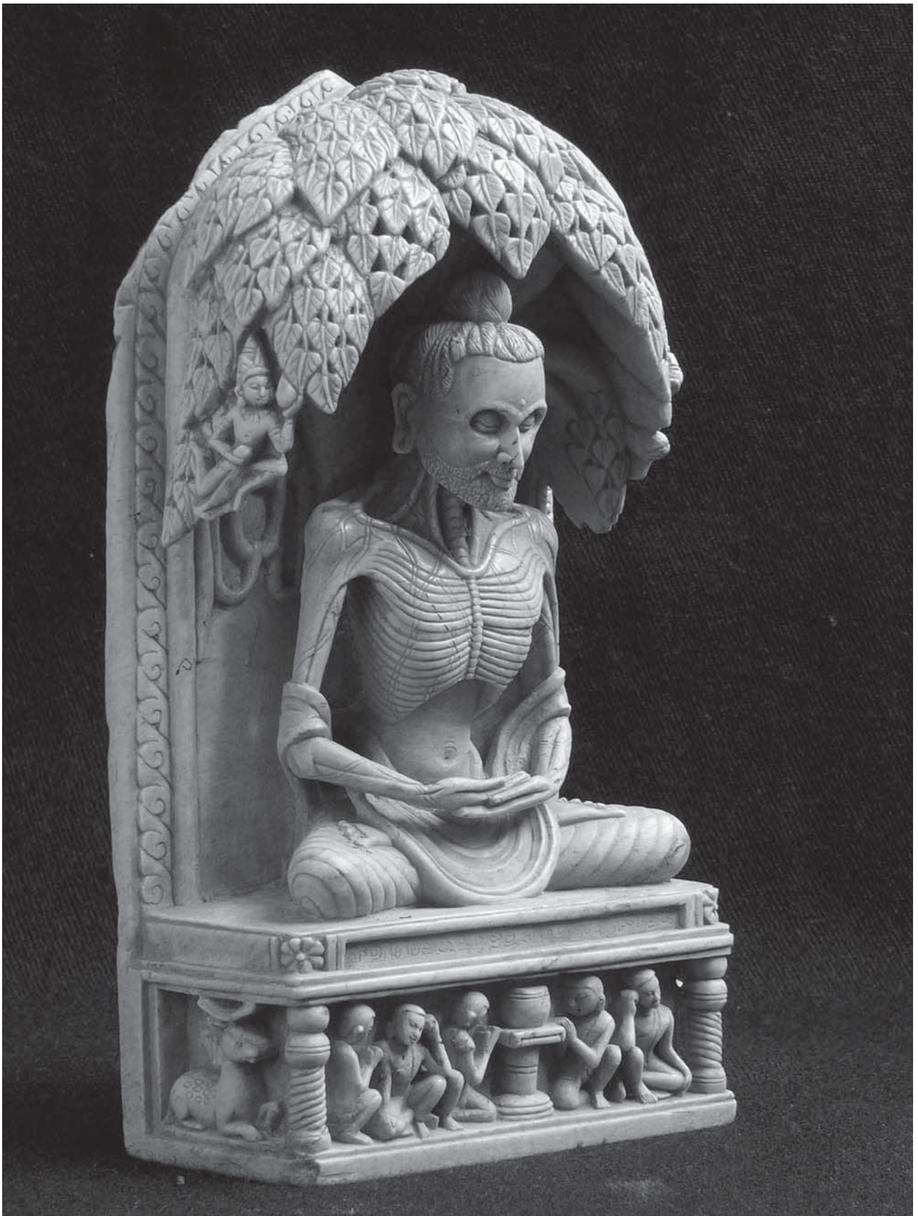
Fig. 10 – The emaciated Buddha, private collection.