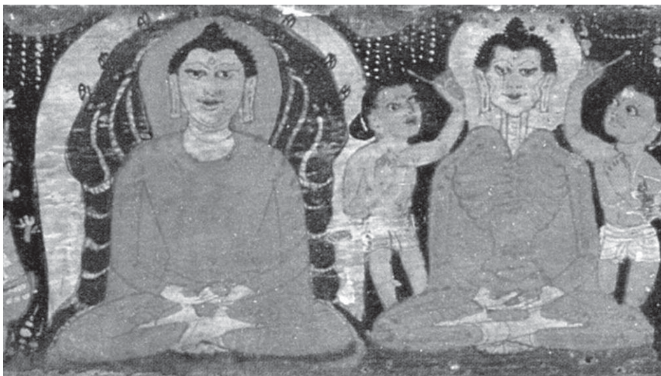
Fig. 5 – The Buddha protected by Mucilinda together with his representation as emaciated. After Pal 1993: 58.