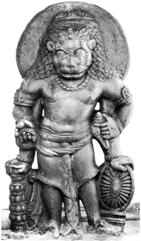
Plate 26.9: Narasiṃha, Shahkund, Bhagalpur District. After Asher 1980: pl. 32.