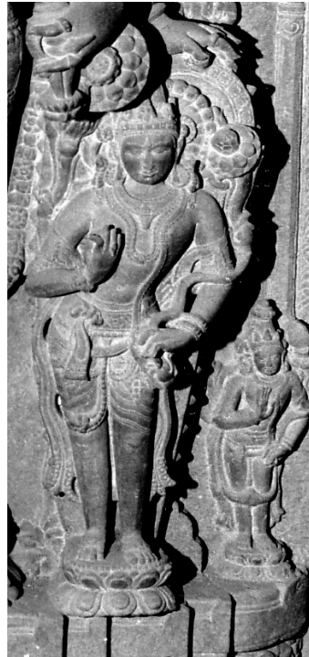
Plate 26.3: Detail of Plate 26.1, Cakrapuruṣa Sudarśaṇacakra.