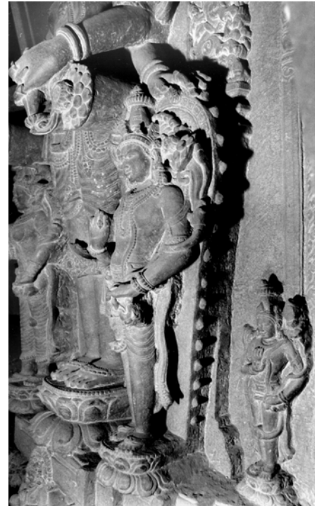
Plate 26.3a: Detail of Plate 26.1, Cakrapuruṣa Sudarśaṇacakra seen from the side.