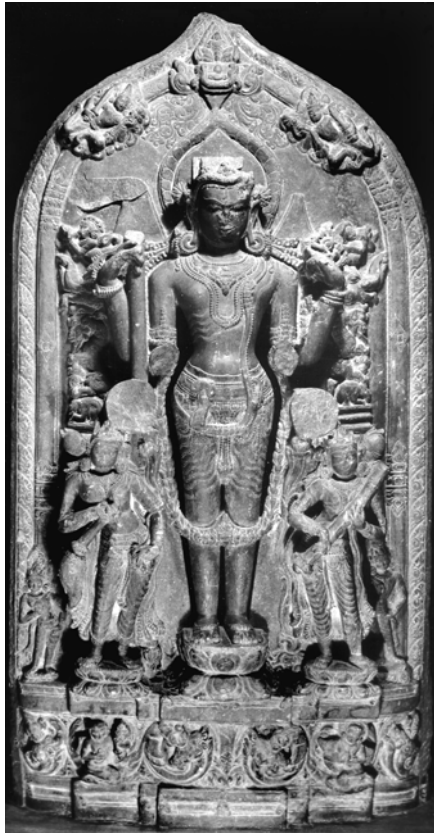
Plate 26.6: Viṣṇu, Gazole, Malda District, State Archaeological Museum, West Bengal, Kolkata.