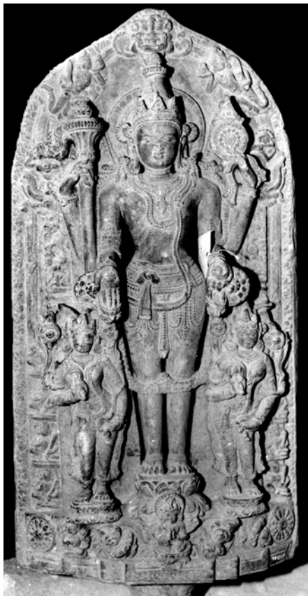
Plate 26.4: Viṣṇu, North Bengal. Bangladesh National Museum.