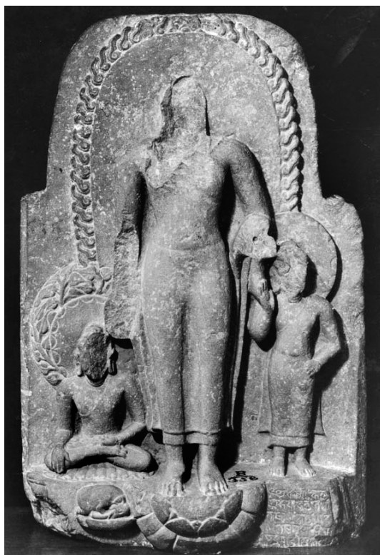
Plate 26.13: Images of the Buddha. Mathura. State Museum, Lucknow.