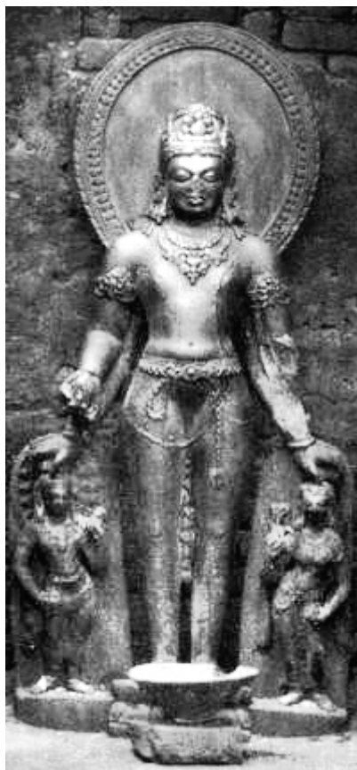
Plate 26.10: Viṣṇu photographed by Joseph Beglar at Damdana, Hazaribagh District (now Jharkand). After www.collectbritain.co.uk (© The British Library Board).