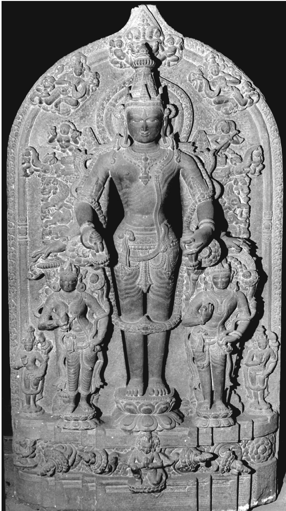
Plate 26.1: Viṣṇu, Sarisadah, 24 Parganas District. Indian Museum, Kolkata, inv. 2592.