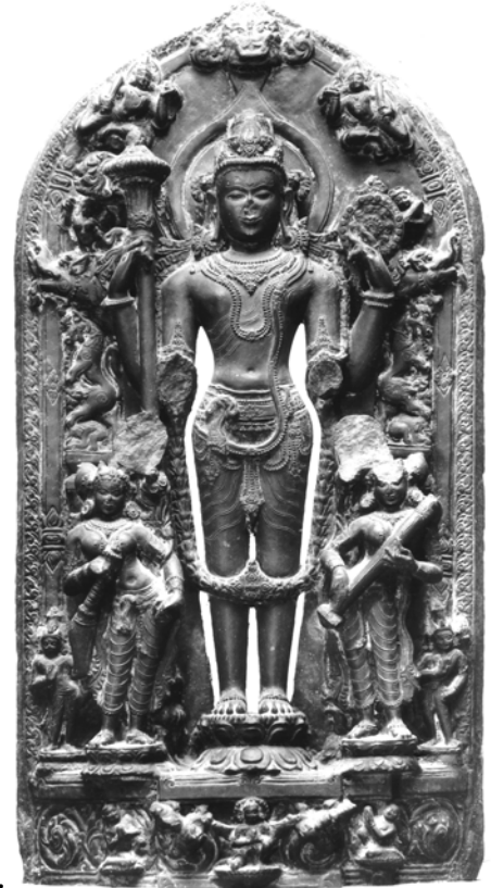
Plate 26.7: Viṣṇu, North Bengal. National Museum, New Delhi, inv. 63.928.