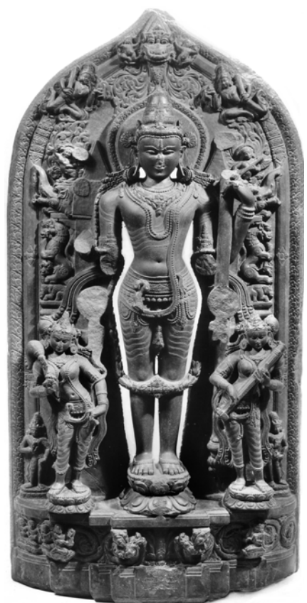
Plate 26.5: Viṣṇu, North Bengal. Asian Art Museum, Berlin, inv.no. MIK I 310.