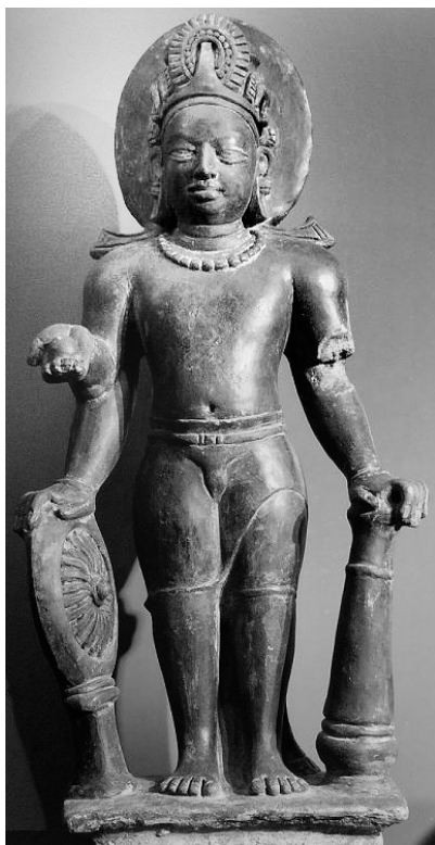
Plate 26.12: Viṣṇu , black slipped terracotta. Region of Mahasthan, Bogra District. Private collection.