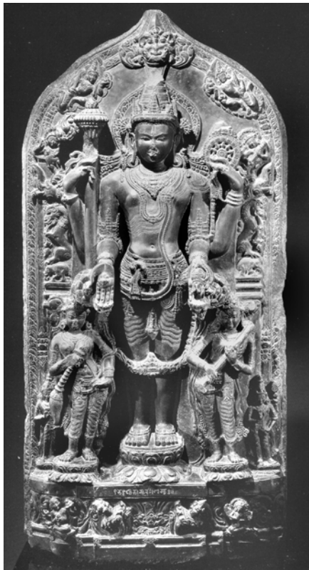
Plate 26.8: Viṣṇu, North Bengal. After Sotheby's 1993: lot 109.