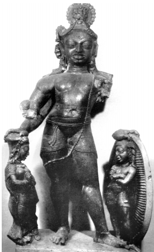
Plate 26.11: Viṣṇu , black slipped terracotta. Rajakpur, Bogra District. Bangladesh National Museum, inv. E-94.2385. After Akmam 2006: 187.