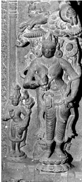
Plate 26.2: Detail of Plate 26.1, Gadādevī Kaumodakī.