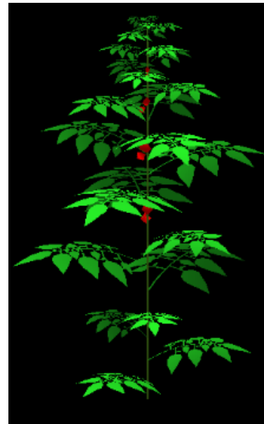
Figure 3. Three-D visualization of a tomato plant at 27 growth cycles

functional sink approach named ‘NewSink’, two types of phytomers we distinguished the phytomers bearing the truss (inflorescences) from the others. Both models simulated